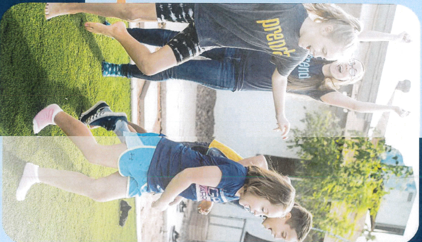
Not a school sponsored event

Small groups of kids will have the opportunity to explore subjects like the arts, technology, engineering, and science with exciting hands-on activities and creative projects.