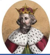
Alfred The Great