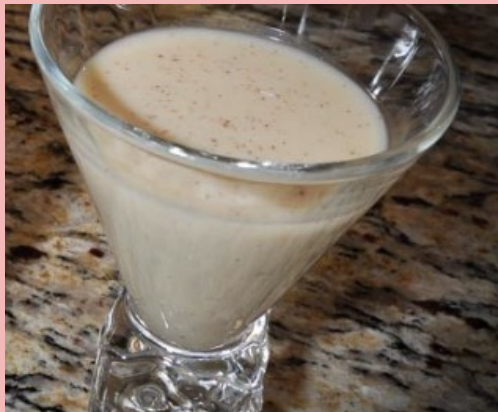
Kremas "Eggless Eggnog" Omit rum to make non- alcoholic version.