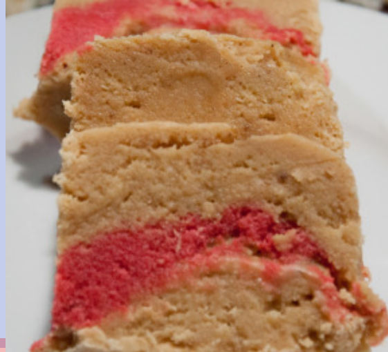
Dous Makos Haitian Fudge