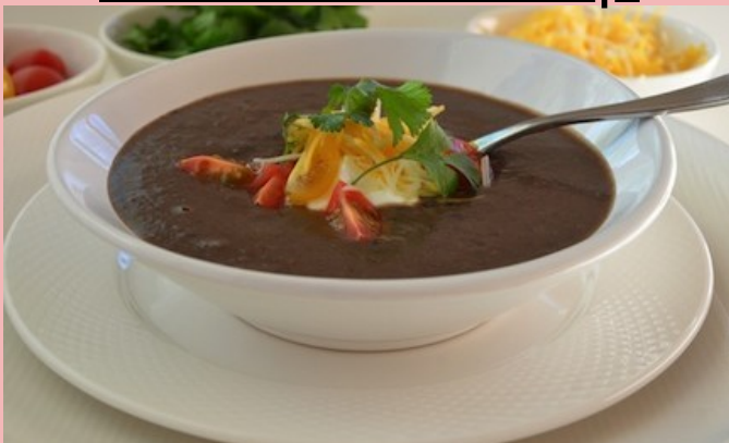
Sos Pwa Nwa Black Bean Soup