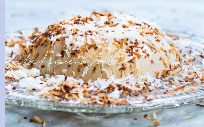
Blan Manje Coconut Flan