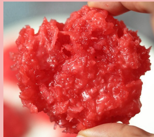
Caribbean Coconut Sugar Cakes