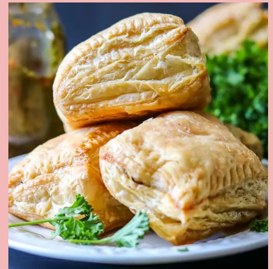
Haitian Pate Haitian Patties