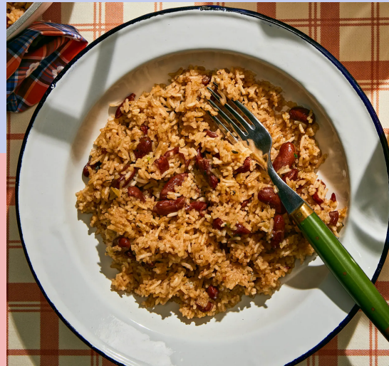
Diri Kole ak Pwa Rice and Beans