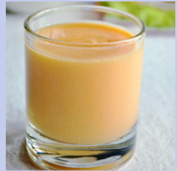
Jus Papaye Papaya Milkshake