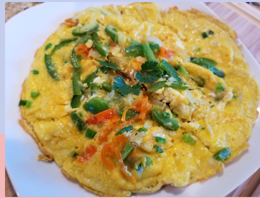
Ze Ayisyen Haitian Omelette