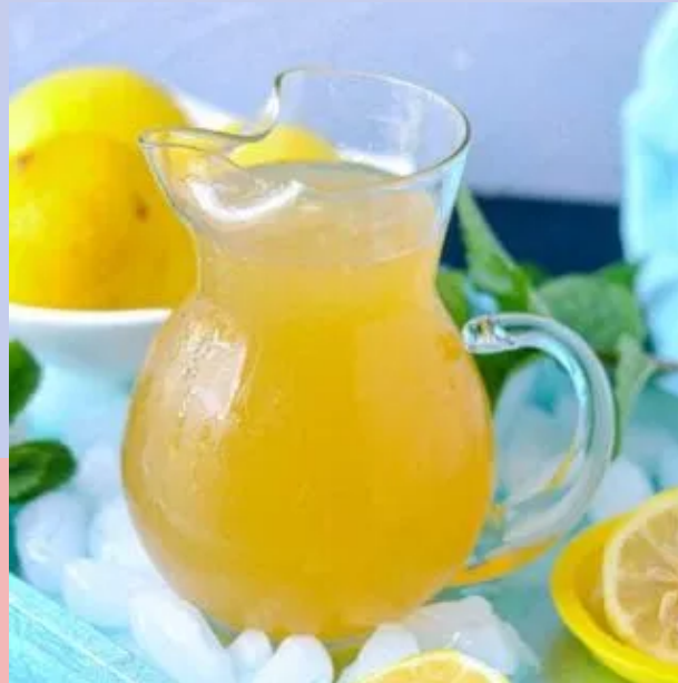
Jus de Citron Lemonade