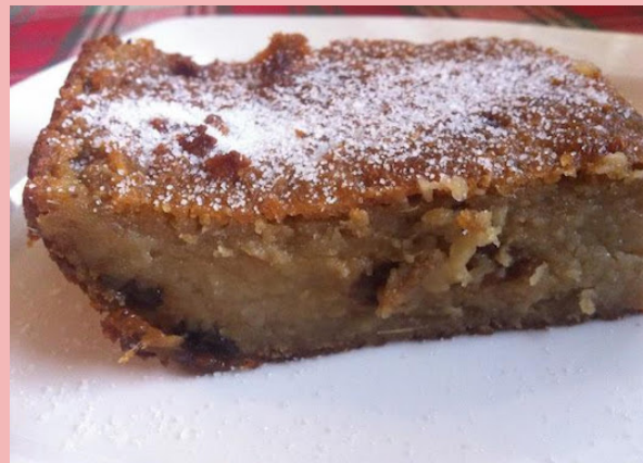
Pain Patate Sweet Potato Bread