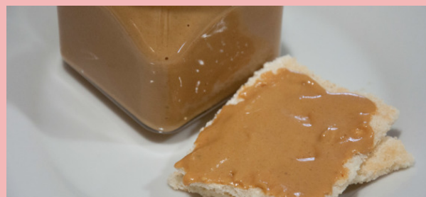
Mamba Haitian Peanut Butter