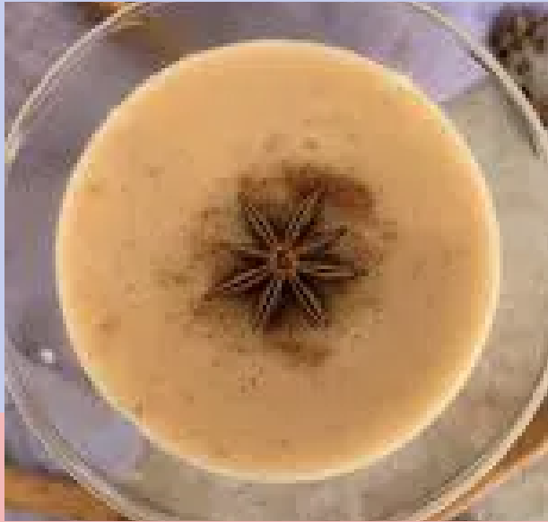
Akasan Corn Flour Shake