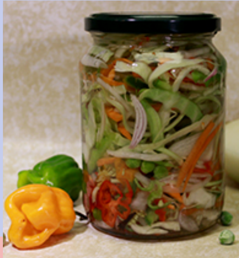
Pikliz Spicy Cabbage Vinaigrette