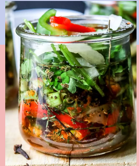
Epis Seasoning Base