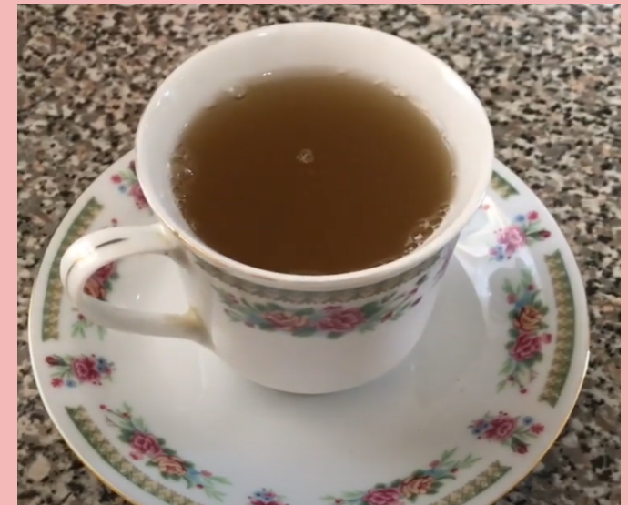
Te Jenjanm Ginger Tea