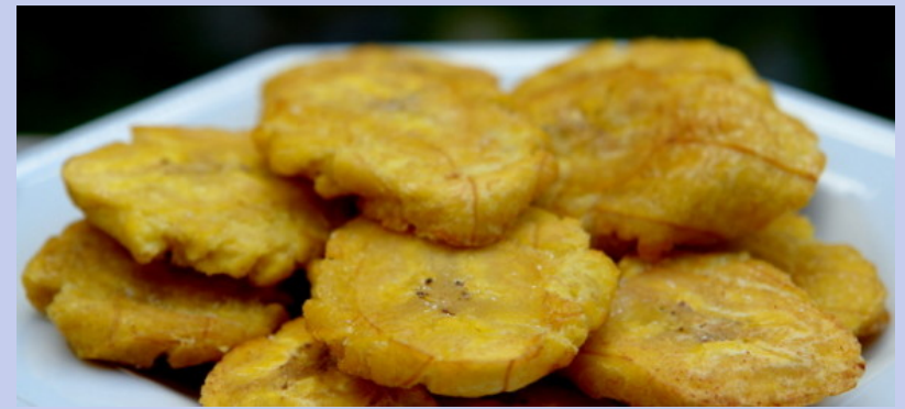
Bannann Peze Fried Green Plantains