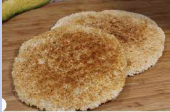
Kasav Ayisyen Cassava Bread (Video)