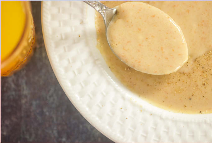
Labouyi Bannann Plantain Porridge