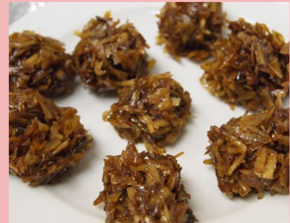
Tablet Kokoye Coconut Candy