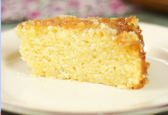
Gateau Orange Orange Cake