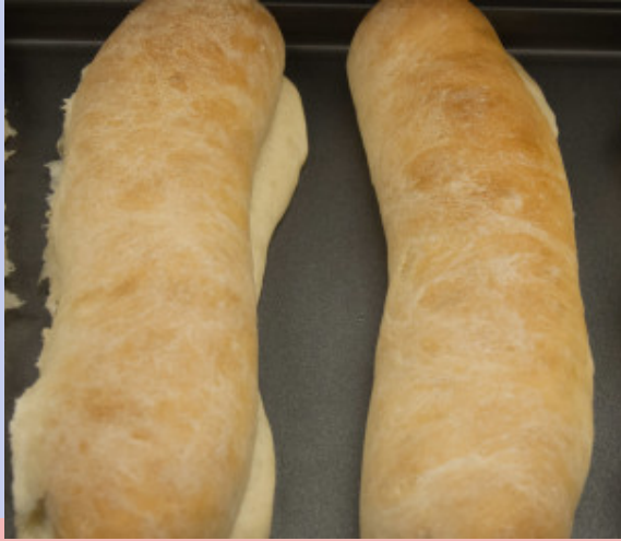
Pain Haitian Bread