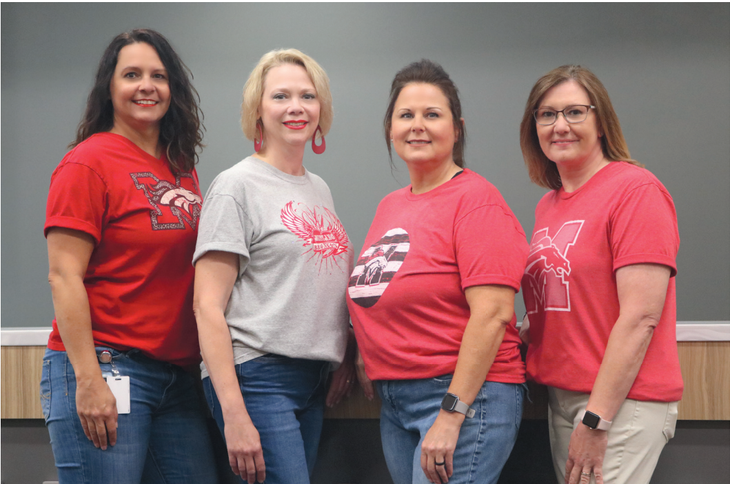
Mustang Community Education Team