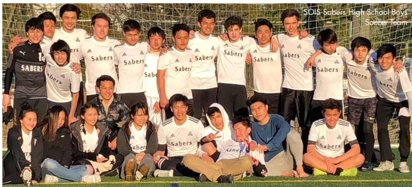
SOIS Sabers High School Boys Soccer Team

As always, thank you for your continued support of the Sabers activities program. Please contact the AD any time you need help. Please visit the AD office, room A-240, near the business office. Contact at pheimer@senri.ed.jp or at 072-727-2137.