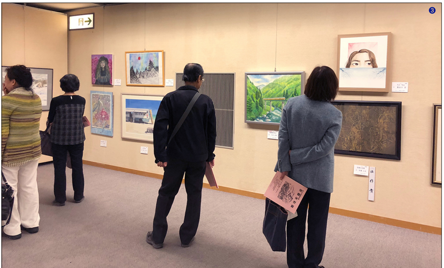
③ Many people attended the exhibition on April 1.