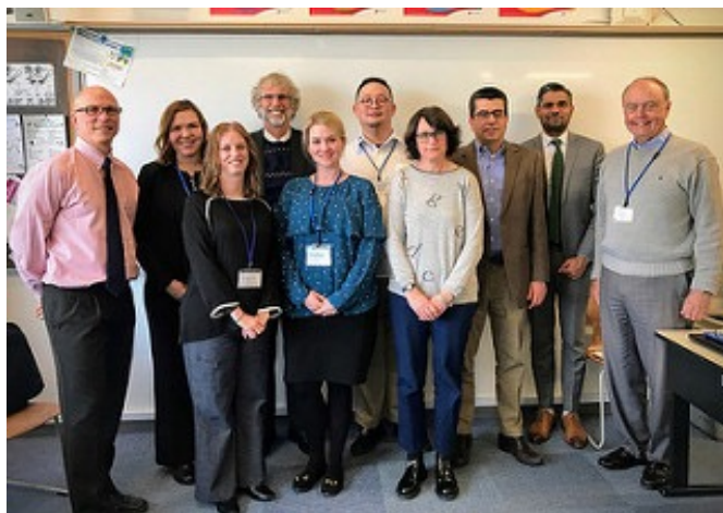
OIS administrators pose for a photo with the Visiting Committee.

I would like to thank students, teachers and parents who assisted with the visit. We are called upon to seek feedback from all community stakeholders. We are ready for our next cycle culminating in the fall of 2022.