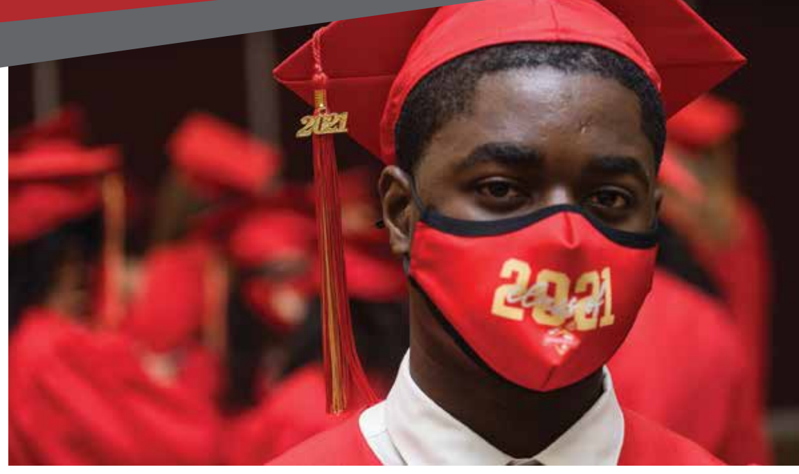
On June 6, the members of the Henry Sibley High School Class of 2021 participated in their commencement ceremony at Roy Wilkins Auditorium in St. Paul. For more photos from the event, visit pages 4-5.

Interested in running for the school board? See page 7!