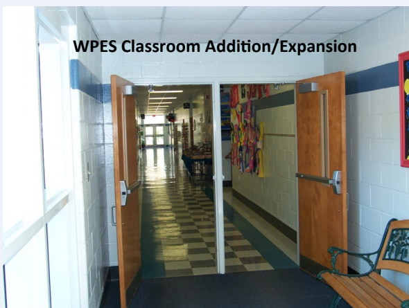
WPES Classroom Addition/Expansion