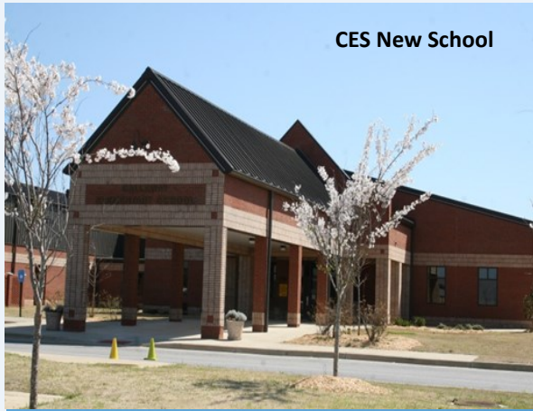
CES New School