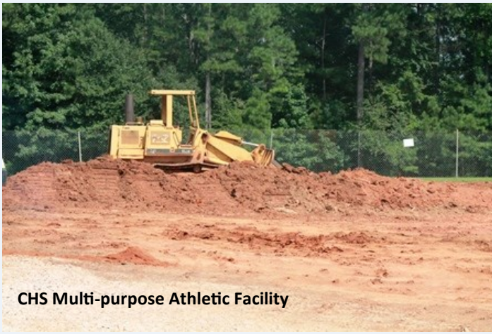
CHS Multi-purpose Athletic Facility