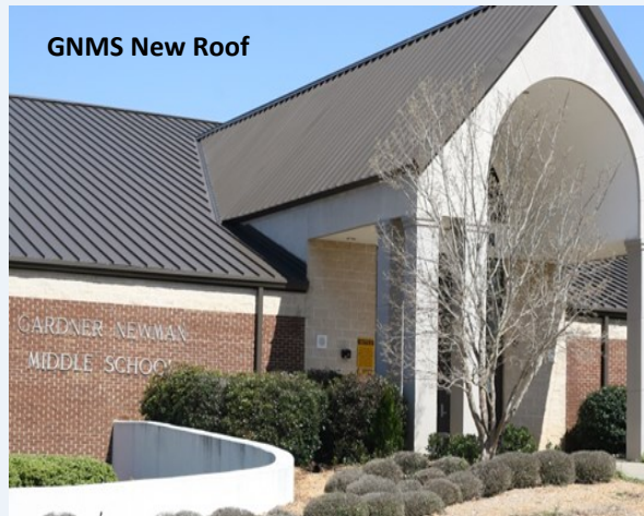
GNMS New Roof