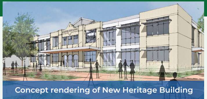
Concept rendering of New Heritage Building