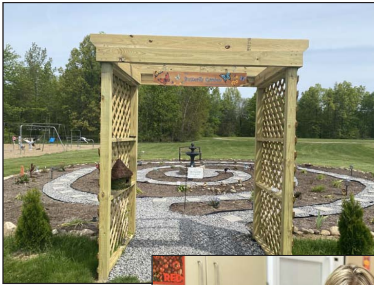
← JMES Butterfly Garden