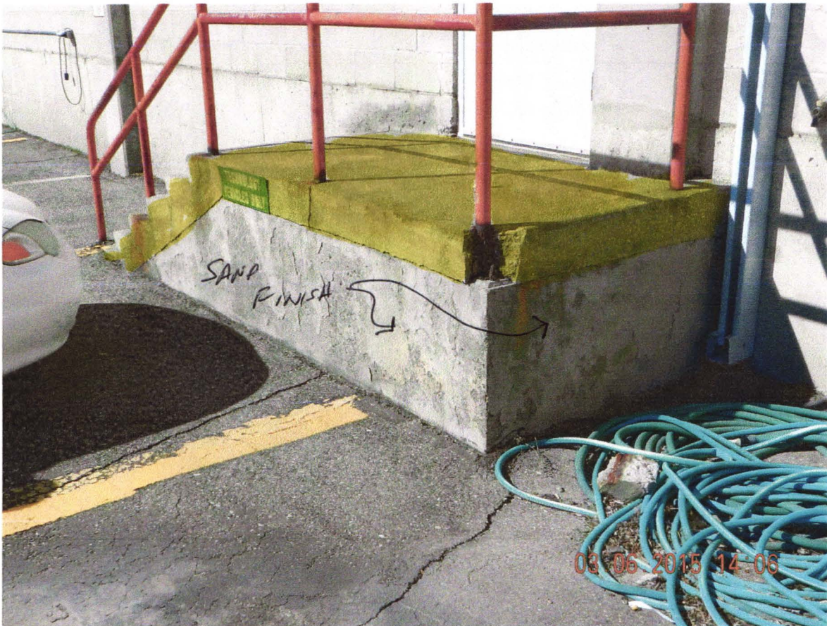
EDUCATION CENTER DOOR #2