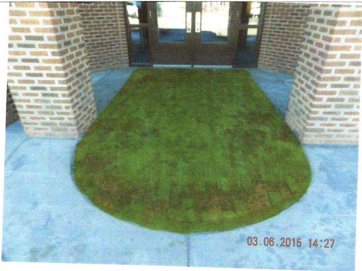
TYHEE ELEMENTARY MAIN ENTRANCE