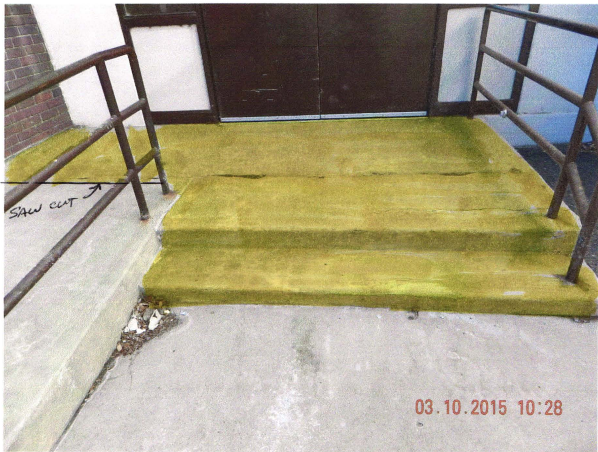
IRVING MIDDLE SCHOOL DOOR #2