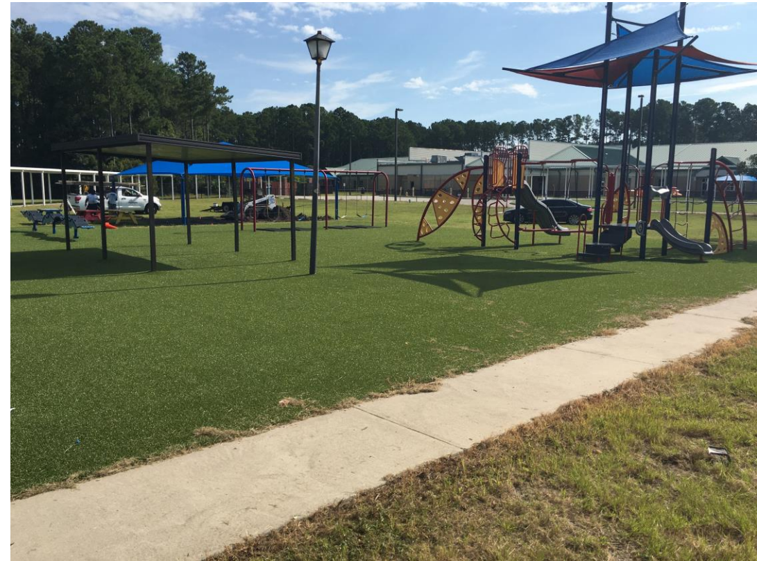
Bluffton Elementary School – Playground