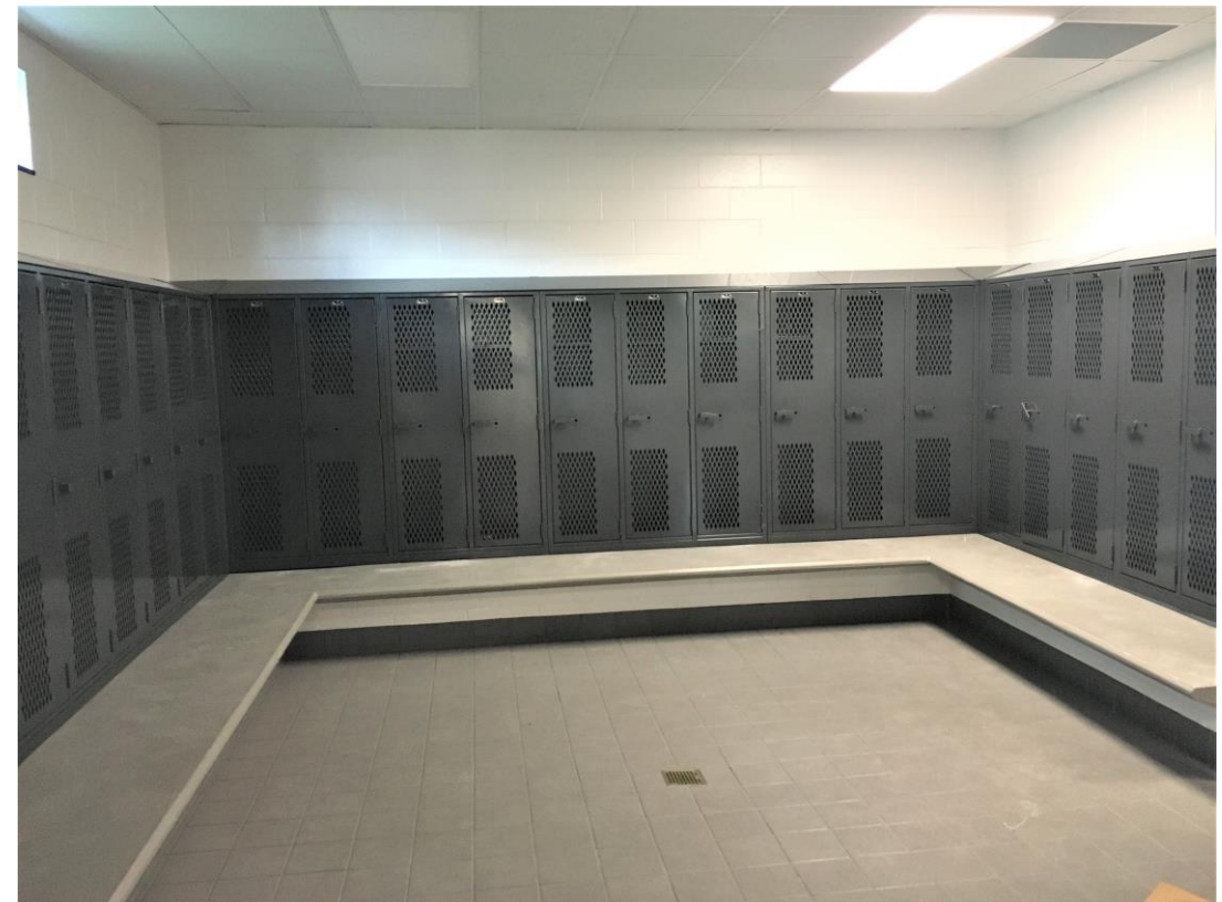
H.E. McCracken Middle School – Athletics (Weight Rm & Locker Rm)