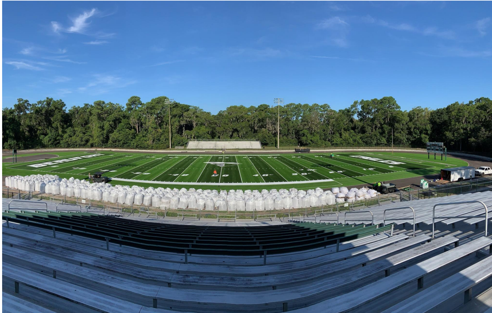
Beaufort High School – Turf Field