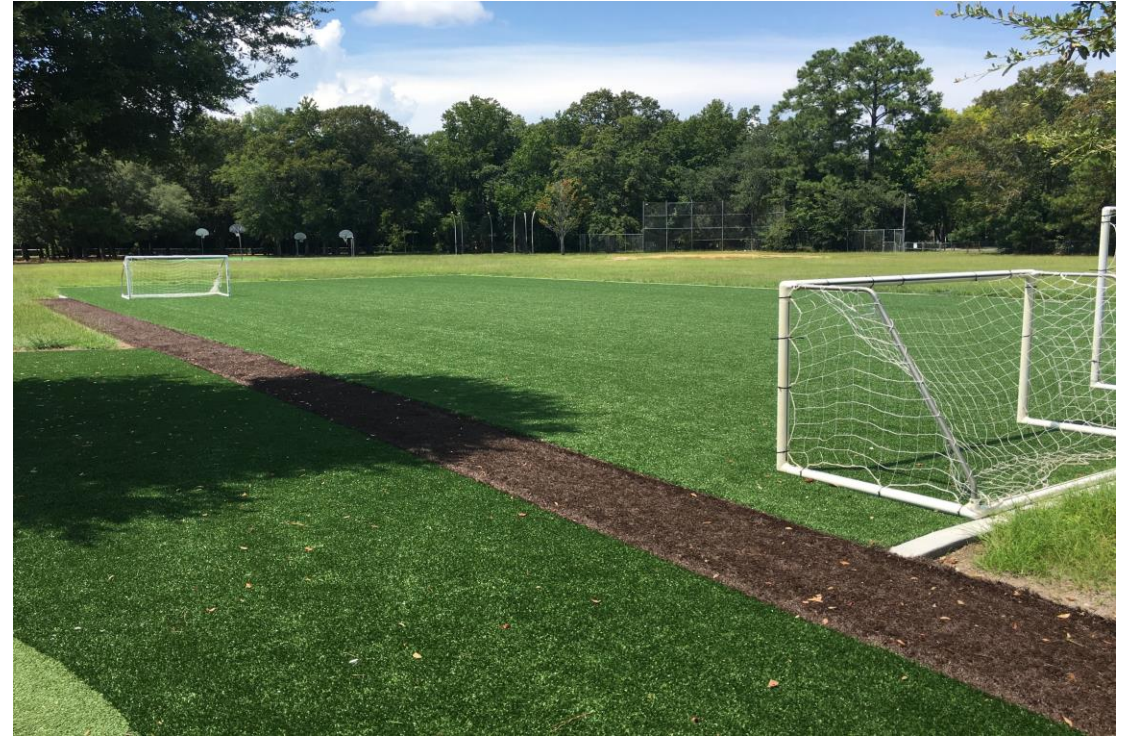
Hilton Head Island Elementary School – Playground & Turf Field