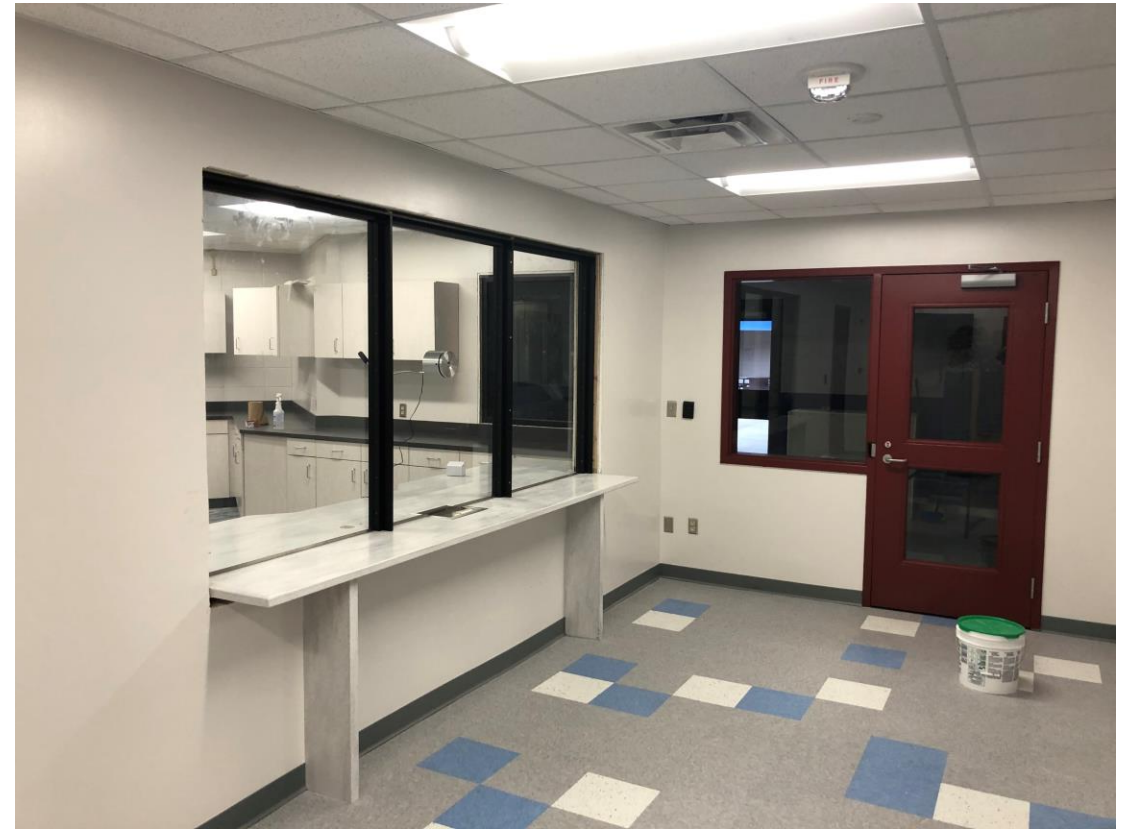
Lady's Island Middle School – Admin and Security Vestibule