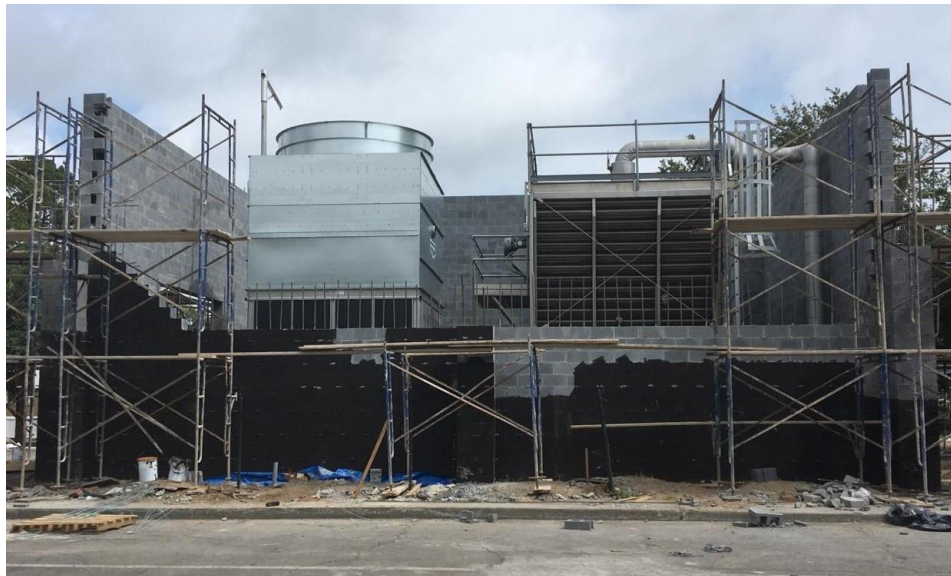
HVAC Cooling Towers