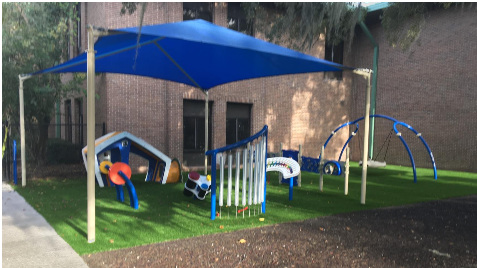
Beaufort Elementary School Special Needs Playground