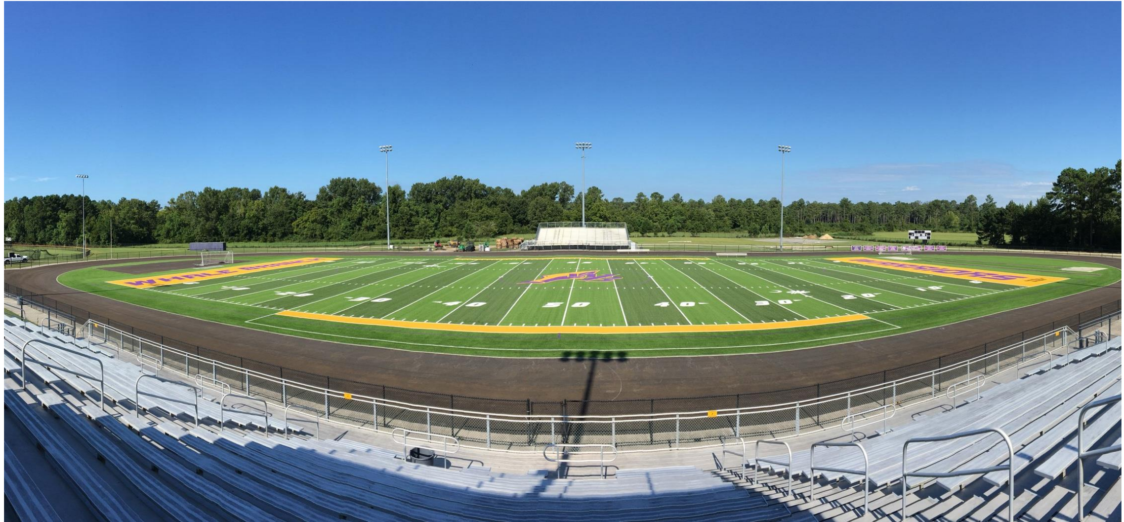
Whale Branch Early College High School – New Turf Field