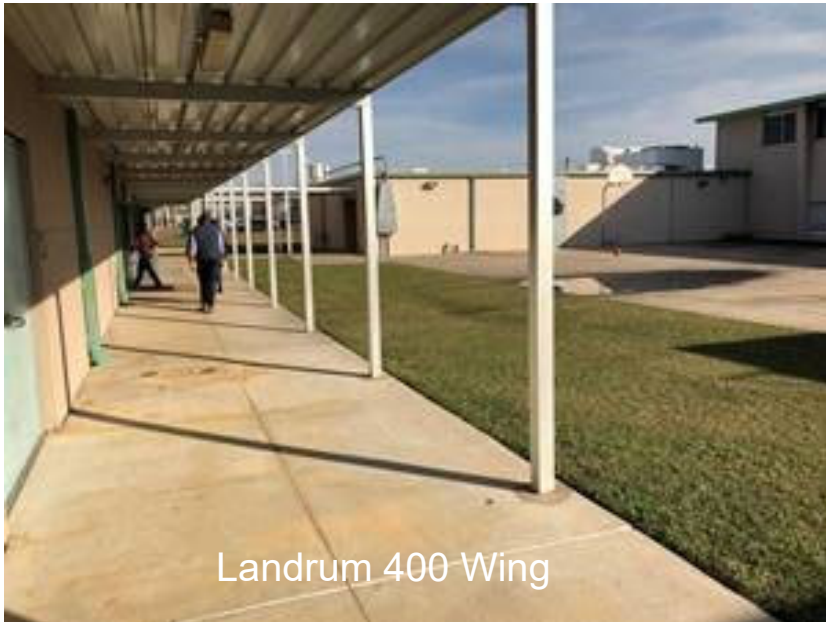
Landrum 400 Wing