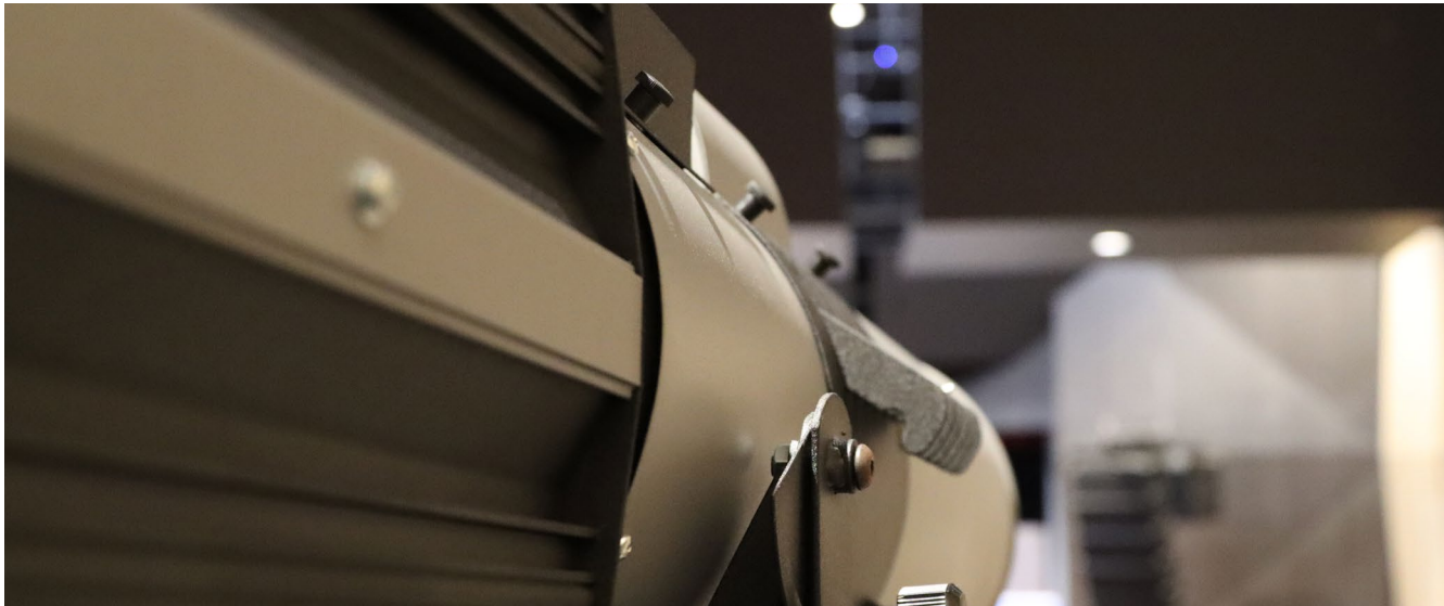
Stratford High School