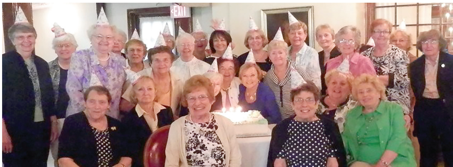
Members of the Class of 1952 at Miller Ridge in LI, celebrating their collective 80th birthdays in 2014.