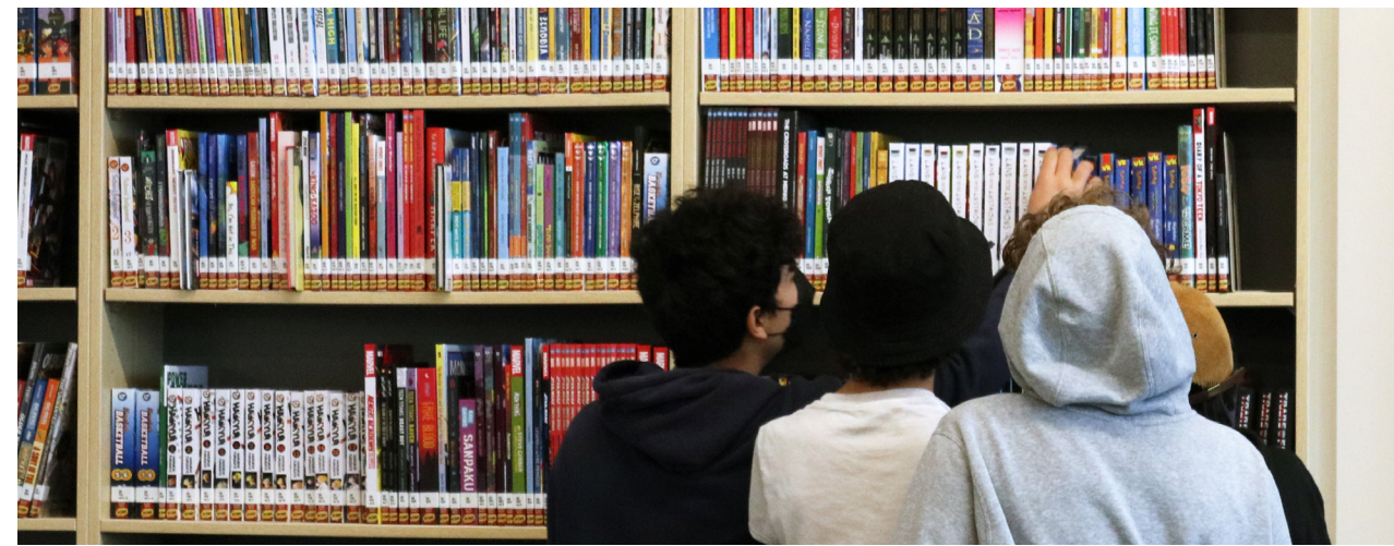
Cougar Mountain Middle School students browse the highly requested and anticipated graphic novel section in their new library.

On a day eagerly anticipated by students, staff and families alike, the beautiful new Cougar Mountain Middle School opened on March 1. For the first time, the student body of about 640 Falcons arrived at the campus in the Talus neighborhood.