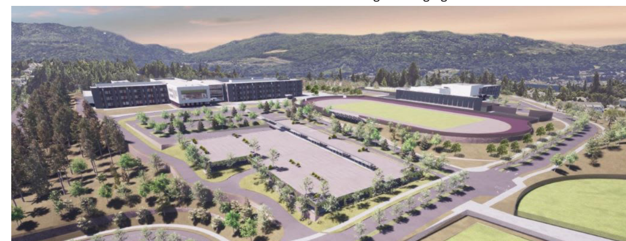
Digital rendering of High School 4 and Elementary 17 site.

As buses and families dropped students off at the new building, the middle schoolers made their way to the commons. "Good morning and welcome to our brand-new school!" teacher Holly Stipe called out on