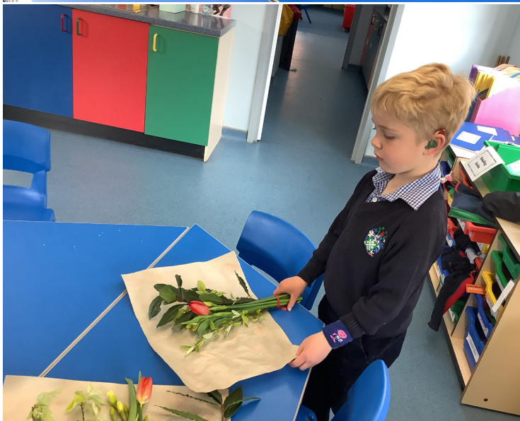
One of the Pre-School's fantastic spring displays.