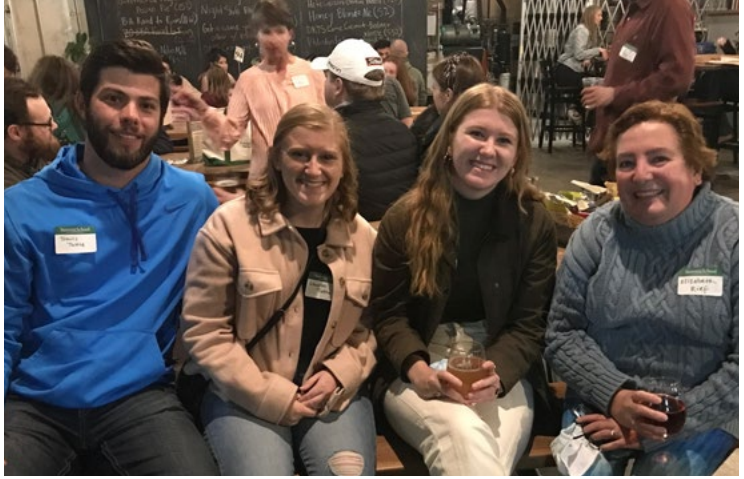
November 2021, classes of 2010-2015 gather at Incendiary Brewing