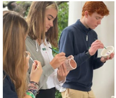
December 2021, classes of 2016-2021 gather at Summit for an interactive reunion