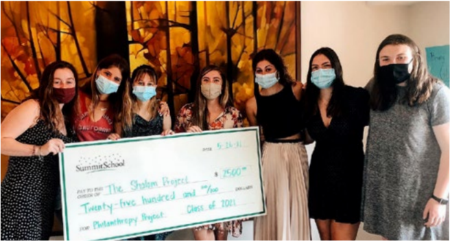
9th grade students present a check to The Shalom Project, a Winston-Salem non-profit. The annual philanthropy project is supported by the Lovett Foundation.