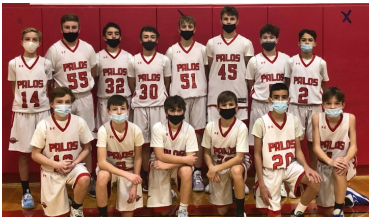
The seventh grade team poses for a picture. They won the consolation bracket at SWIC this year.