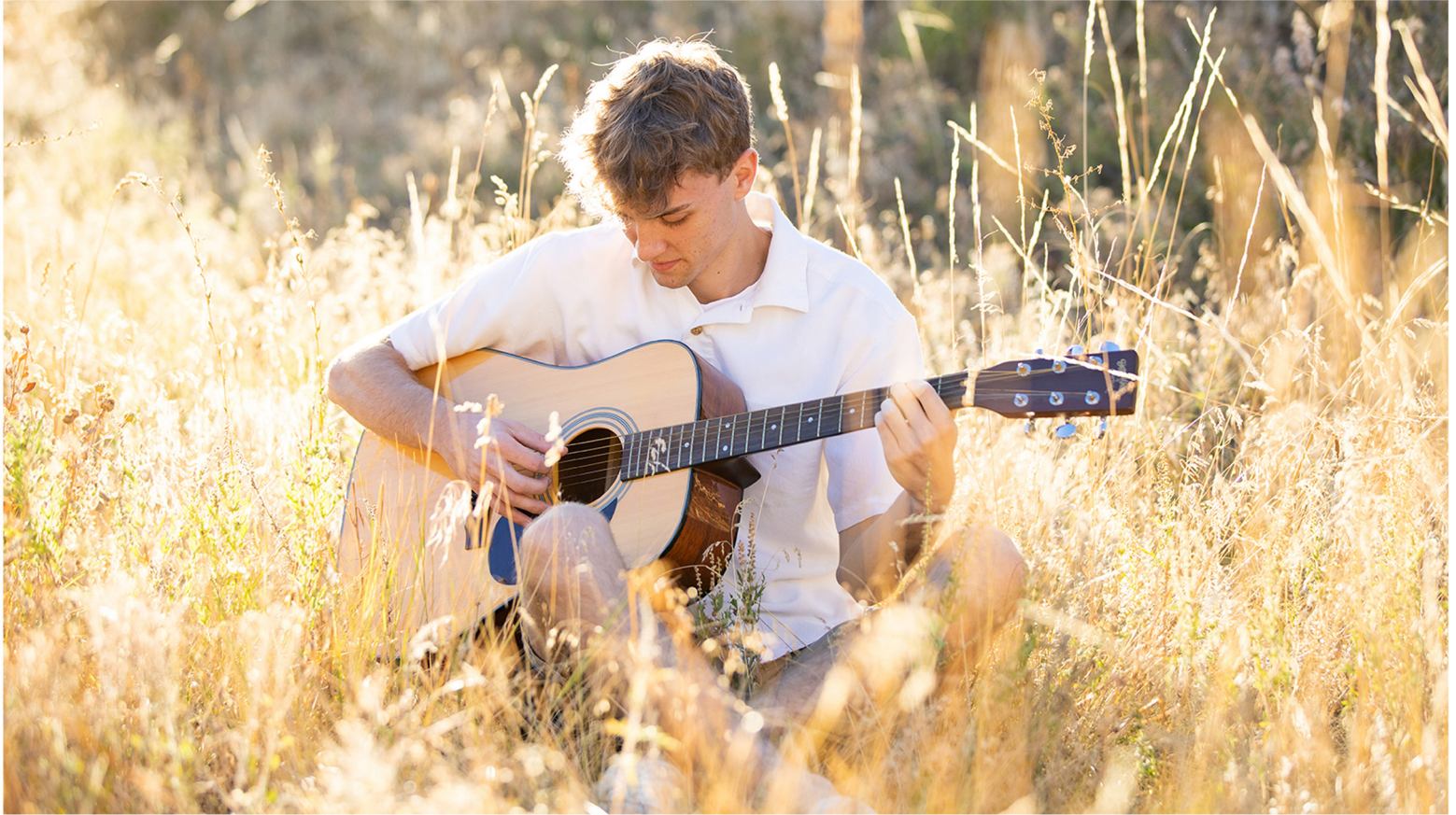
Class of 2022 were all about their pups!

Do you have a hobby, a cool car, a favorite book or candy? Do you play a sport or musical instrument? Is there something that you love and want to include in your senior portraits? Bring anything you want to – we especially love to meet your pets!