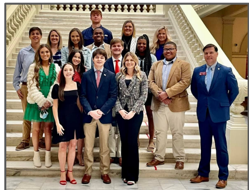
Student Council Visits State Capitol