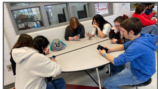
Students Recognized for Superior Attendance & Behavior