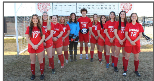
Soccer Seniors Recognized