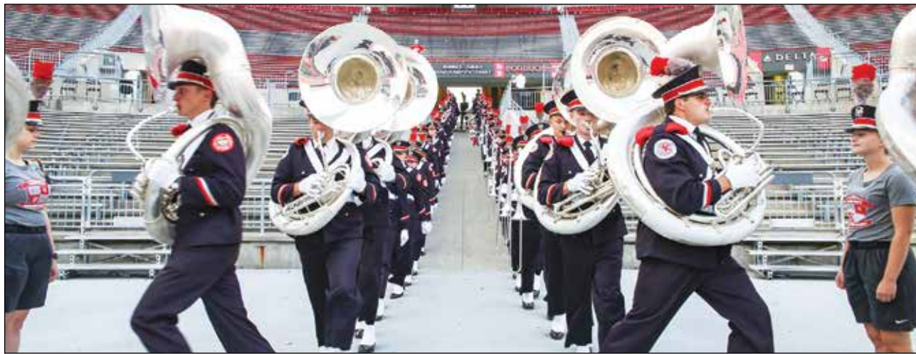
The OSU Marching Band enters Ohio Stadium.