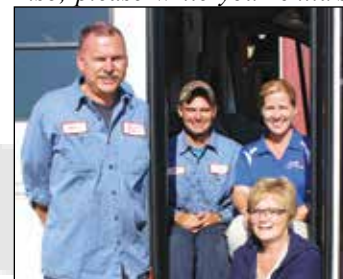
Staff at Transportation Office

NOTE: Consider providing your small child with an index card including their name, address, and your phone number in their backpack. Teach your child to show the driver the index card if the child is unsure about getting to/from home. This can help the driver to avoid making "wrong stop" mistakes. Also, please write your child's name on everything they bring (backpack, lunch box, jacket, sweater, and hats). Items are commonly left on the bus and are put in a lost and found at the Transportation department.