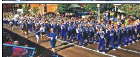
The Lake Marching Band in the Hall of Fame Parade.