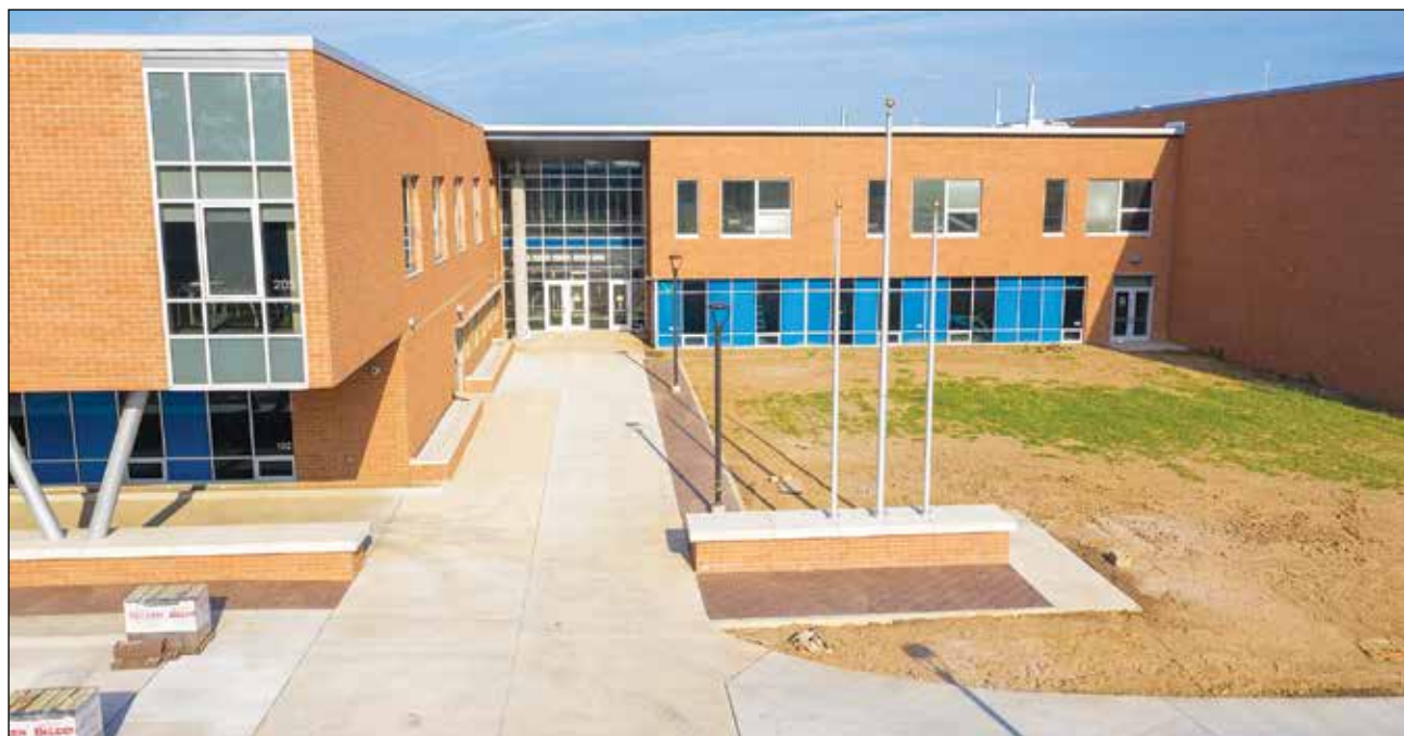
Lake Middle High School's new east entrance will be completed for the start of school.