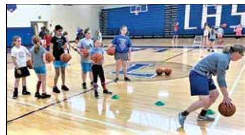
Learning skills during camp.

Basketballs were flying through the air, young bodies were pounding down the courts, and lots of encouragement was provided earlier this summer during basketball camps offered by Lake coaches, their assistants, and returning junior varsity and varsity players.