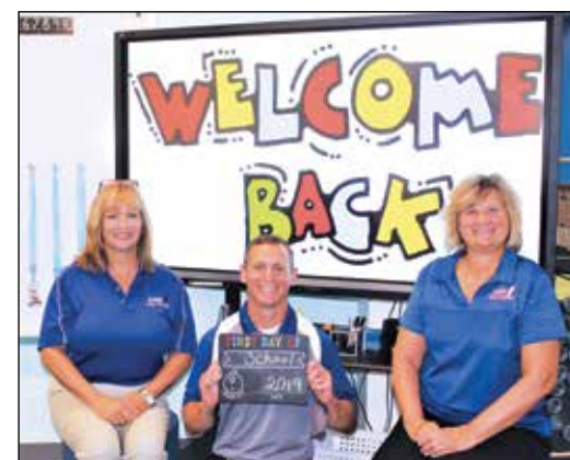
Principals at Lake Elementary are ready for the start of school.

We look forward to the first day of school on Tuesday, August 20, 2019.