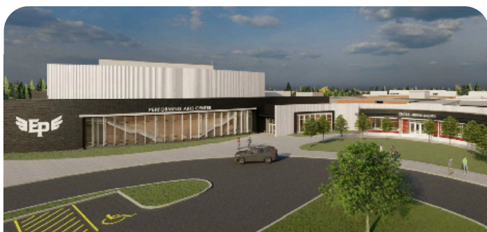
New state-of-the-art classroom wing, performing arts center and gym