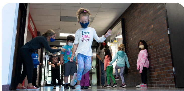
Forest Hills Sensory Path

A positive, welcoming and collaborative atmosphere awaits students at Forest Hills Elementary. Teachers and staff nurture students' love for learning while challenging them to work at their highest potential. We have built a reputation for successfully bringing out the best in every student. Thanks to our dedicated teaching staff, we are constantly employing new practices and techniques in Forest Hills classrooms.