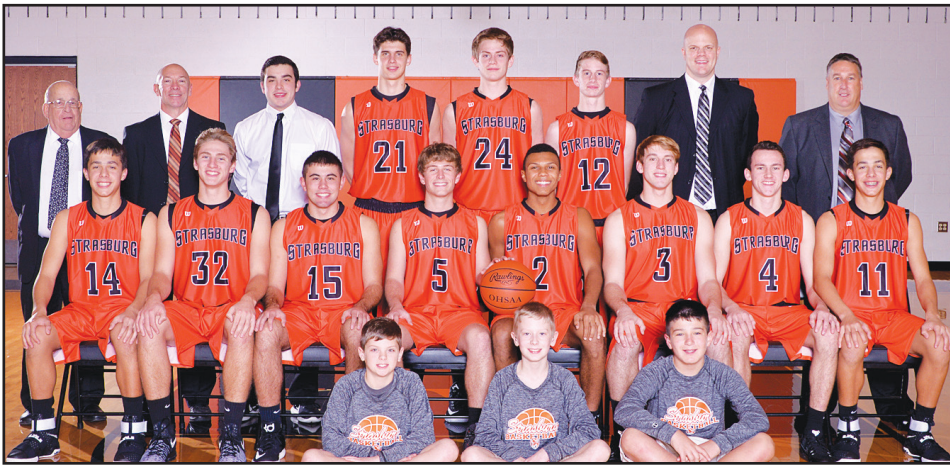
Boys Varsity Basketball