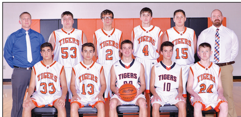
Boys Freshman Basketball