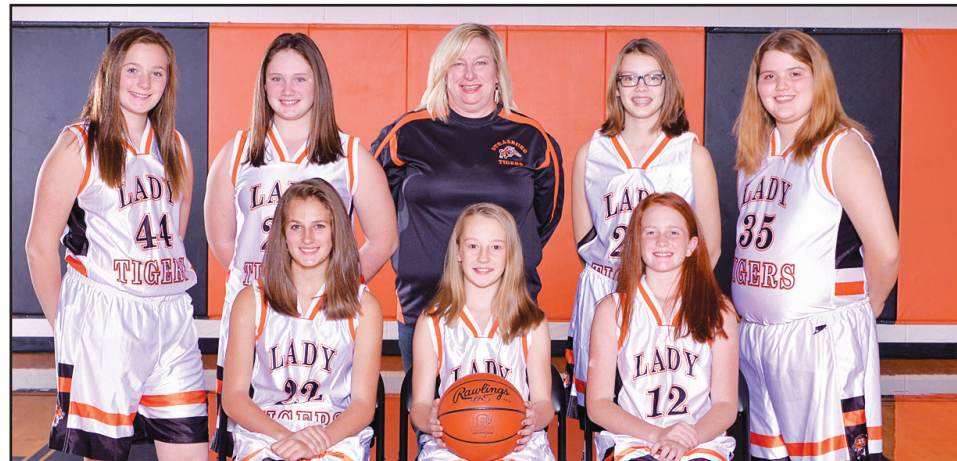
Girls Seventh-Grade Basketball