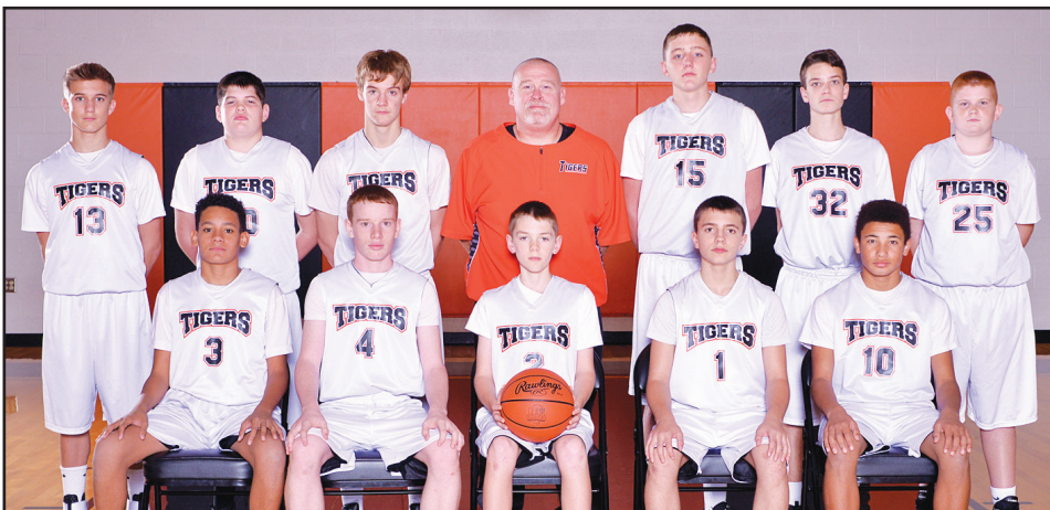
Boys Eighth-Grade Basketball