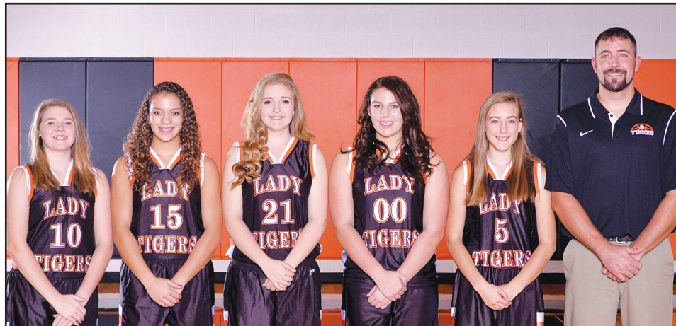
Girls Eighth-Grade Basketball