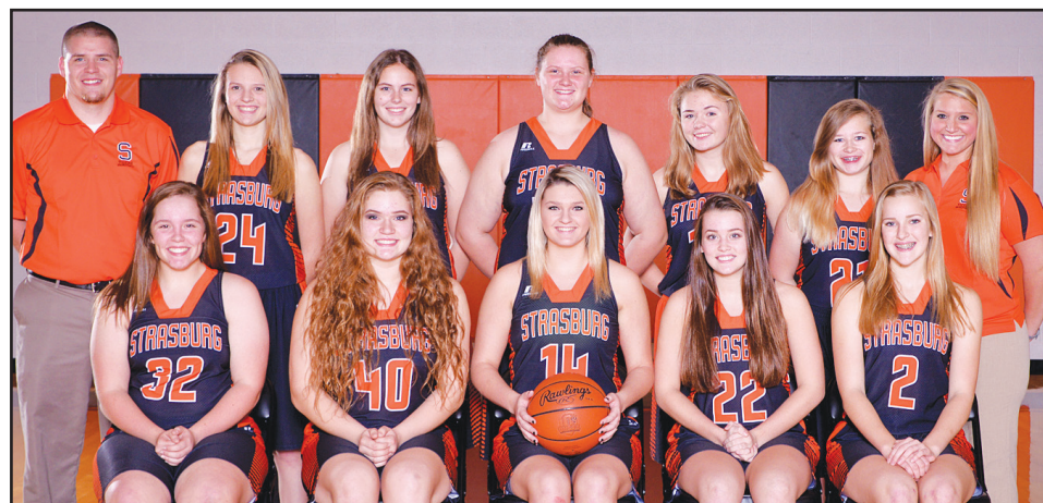
Girls Varsity Basketball