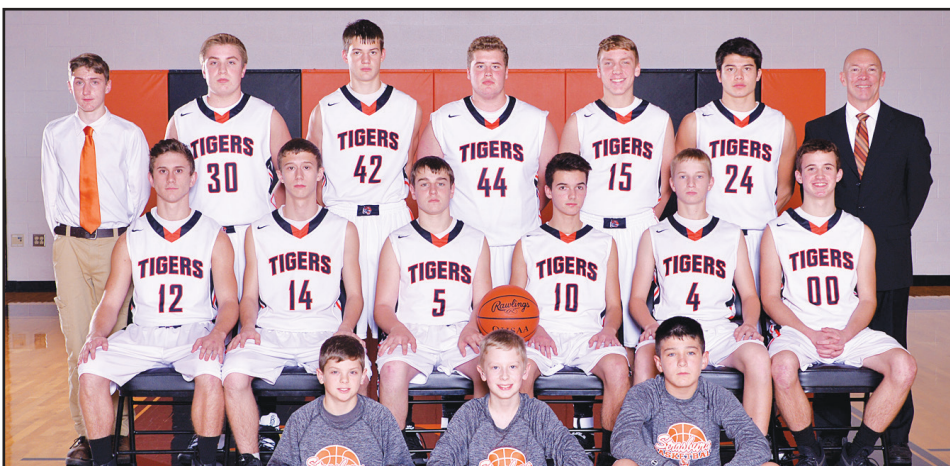
Boys Junior Varsity Basketball