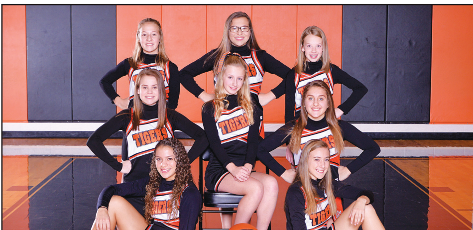
Junior High Cheerleaders