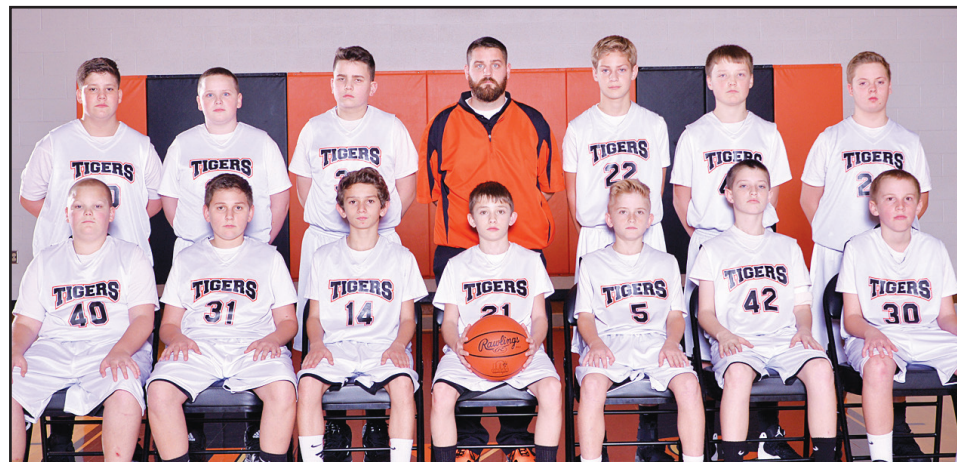
Boys Seventh-Grade Basketball