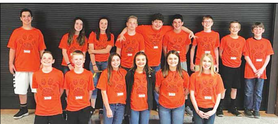
Seventh-grade Math Team