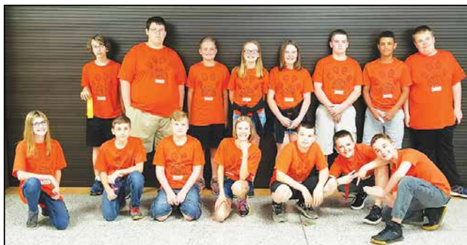
Sixth-grade Math Team