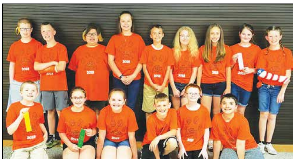
Fifth-grade Math Team