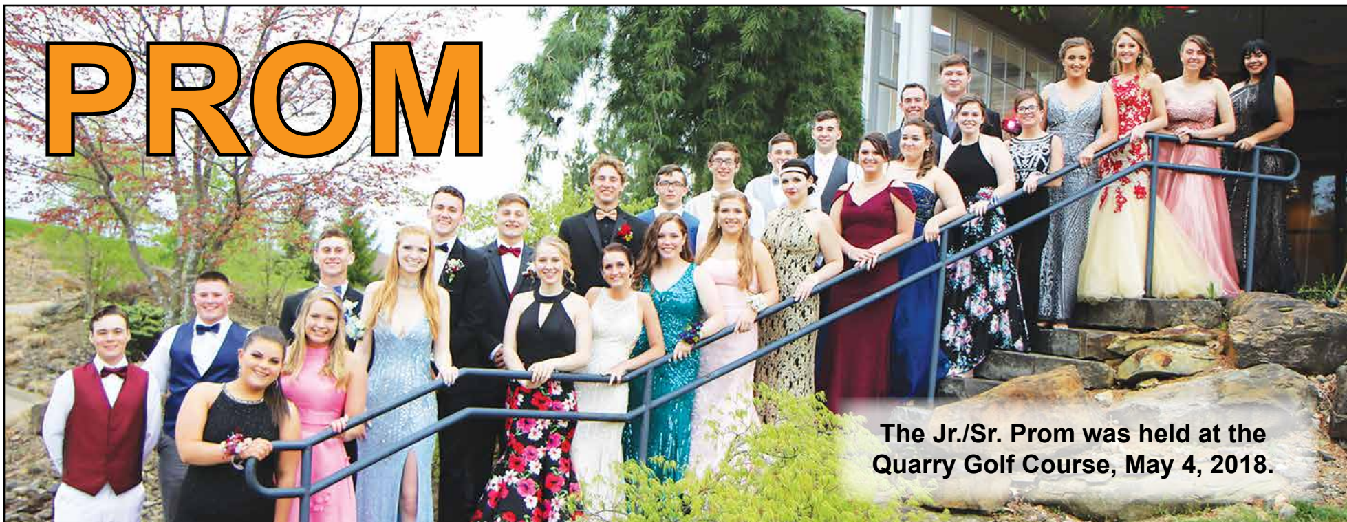
The Jr./Sr. Prom was held at the Quarry Golf Course, May 4, 2018.