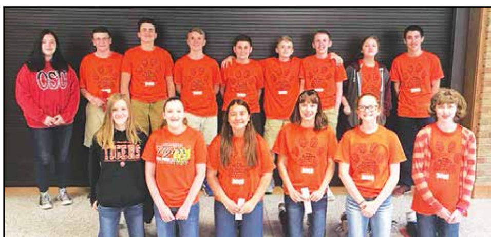
Eighth-grade Math Team