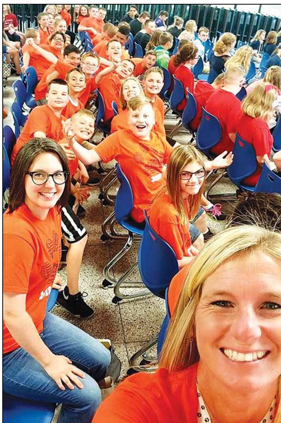
Fifth and sixth-grade math teams waiting for awards ceremony.