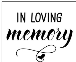
Ethan Holder Class of 2025