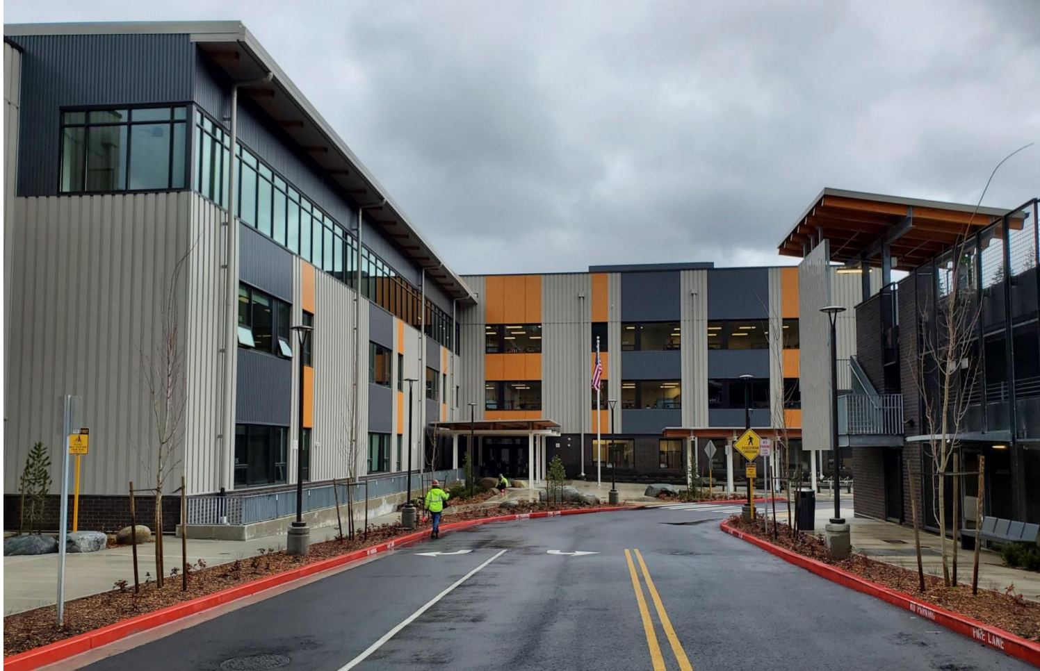
View of the Main Entrance Drive into the site