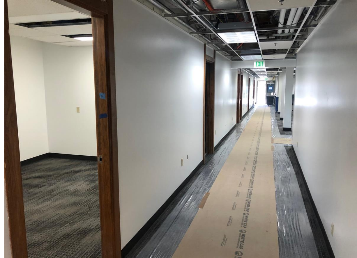
Classroom and corridor finishes being installed