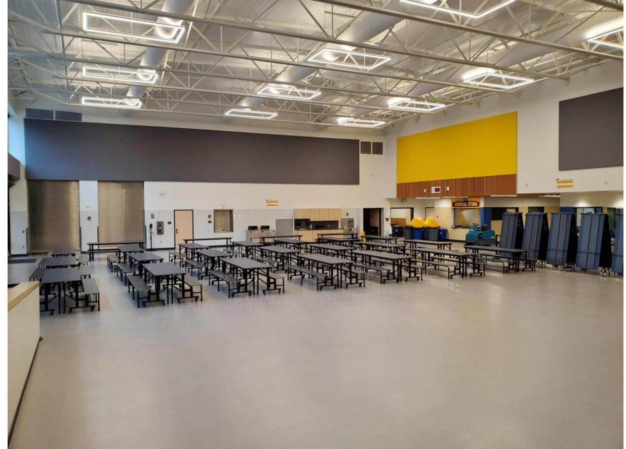
The Commons complete and stocked with lunch tables