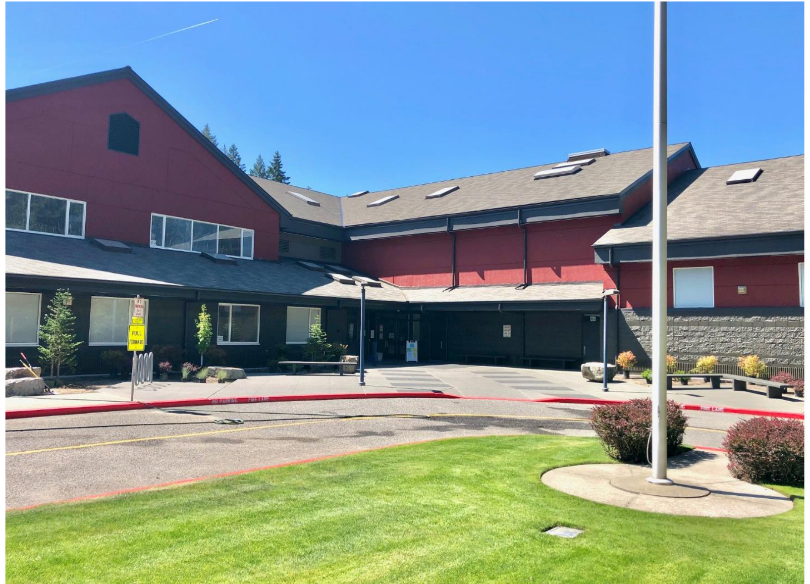
Painting of the exterior of the building complete.