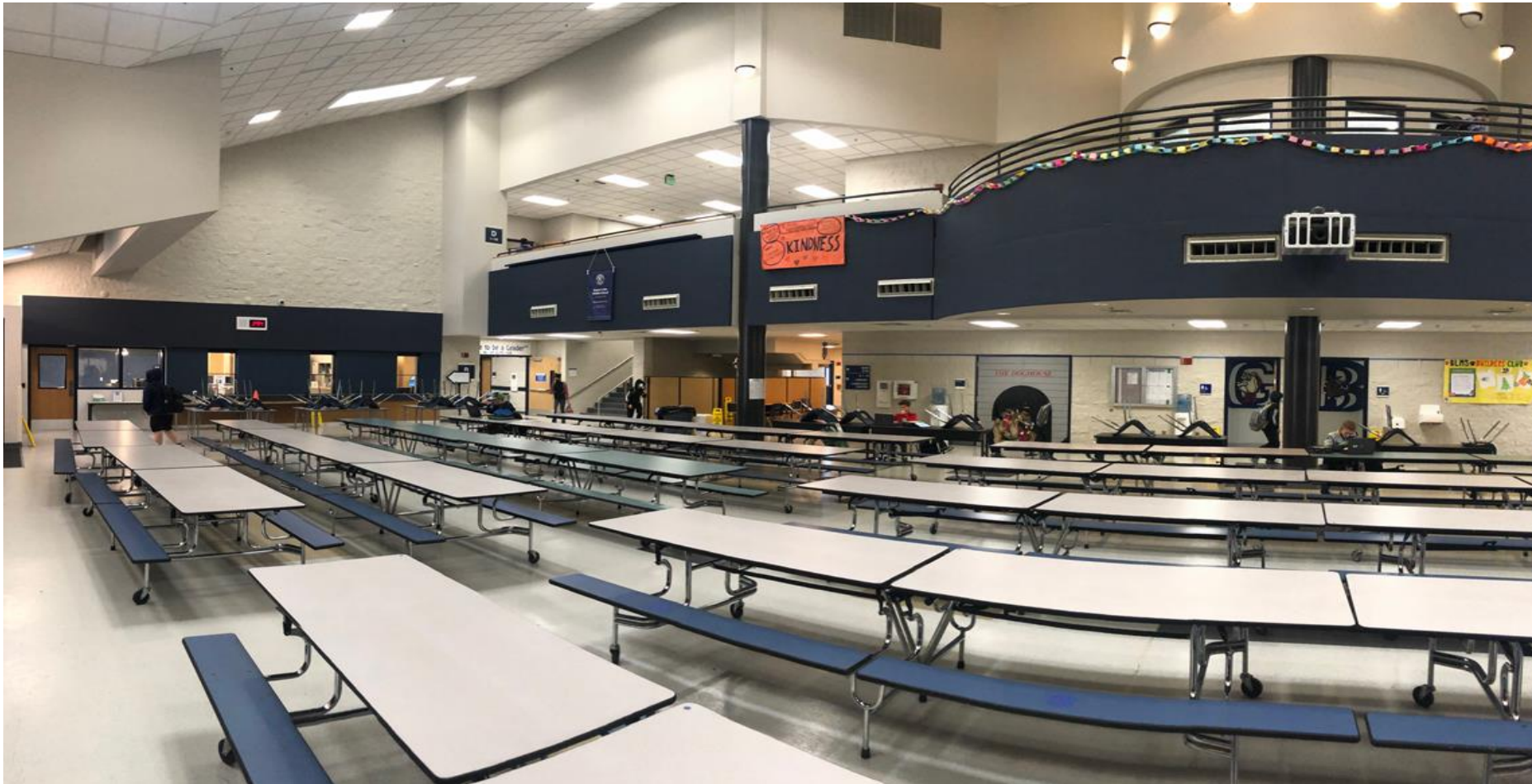
Commons area finishes complete