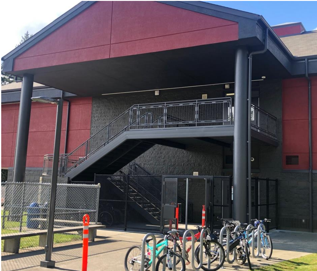
Fencing and gates for additional security added to some exterior entrances of the building