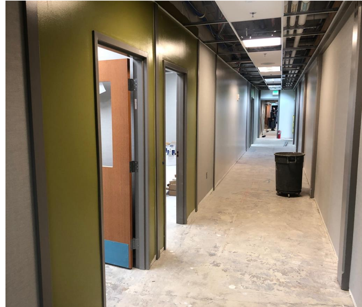
Health Room and corridor finishes being installed