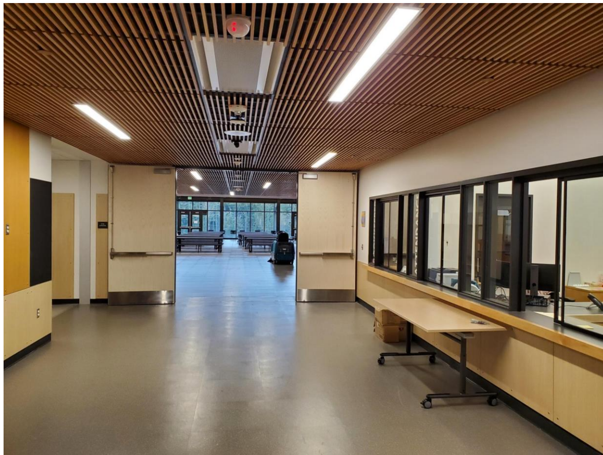
View of the Main Entry corridor area to Commons and the of the school (the Main Office area is on the right).