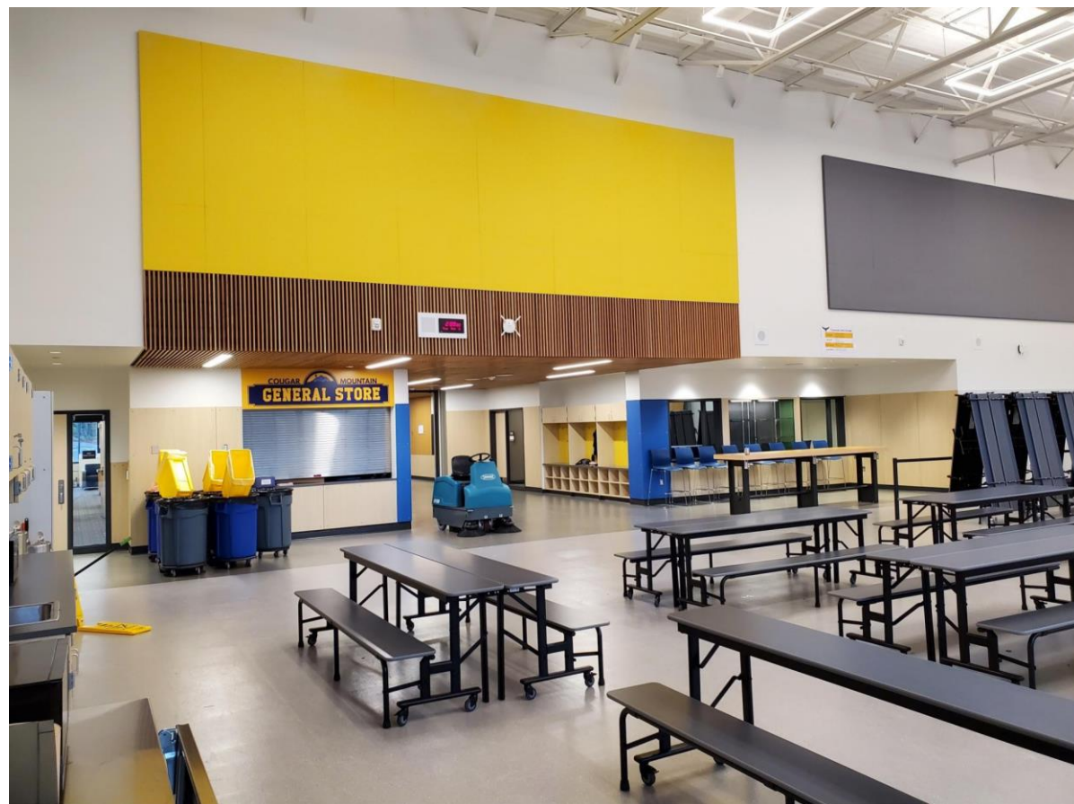
View of the Student Store and surrounding area from the Commons