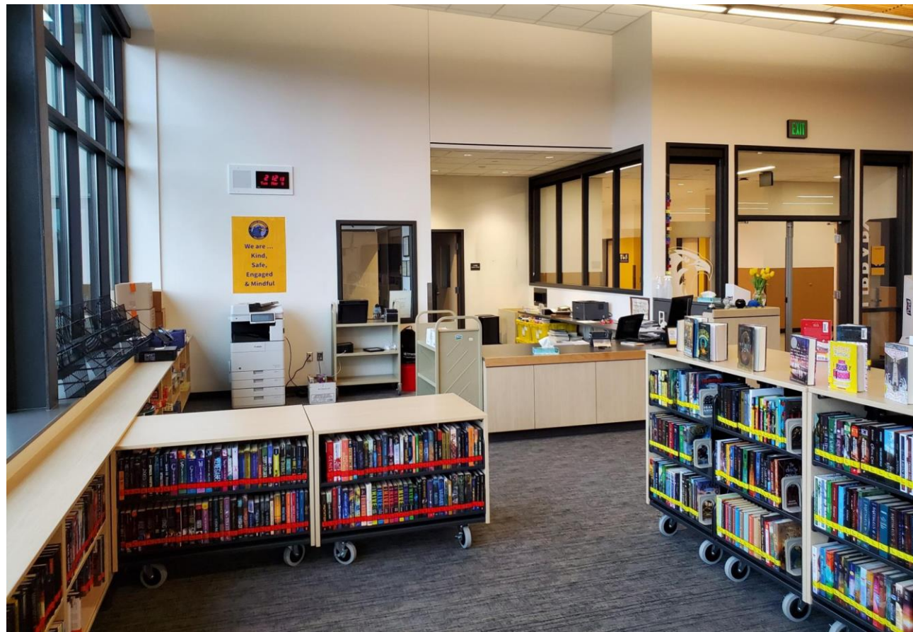
View of the Library Reception/Check-out area