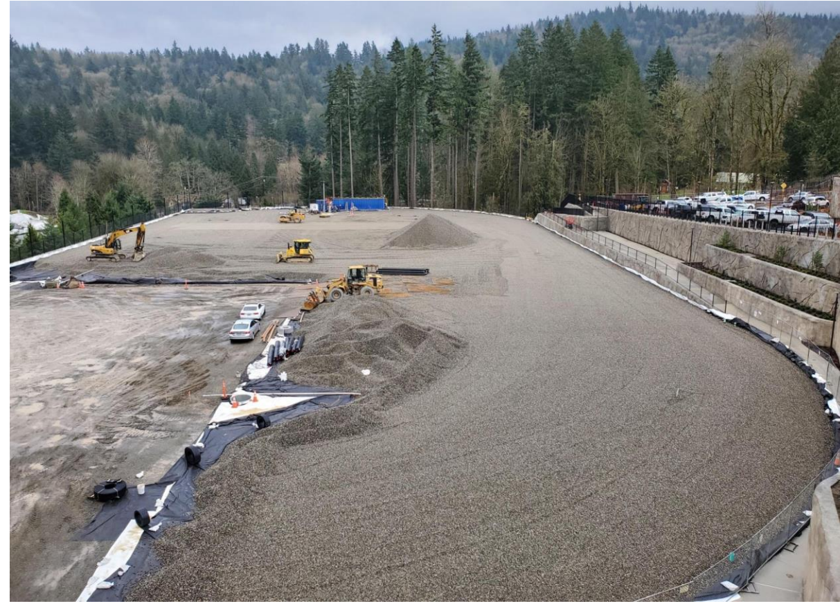
Sports Field work progressing.