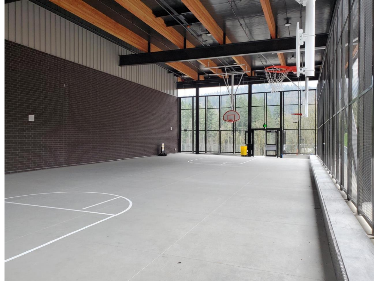
Views of the completed Covered Play area