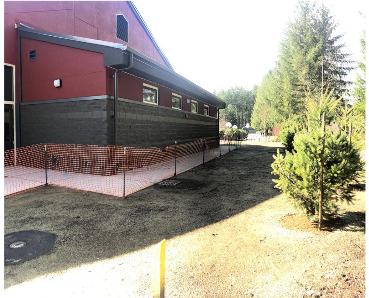
Music Room Storage addition complete