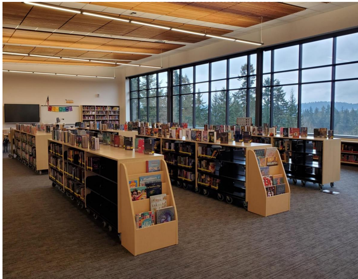
View of the Library stocked with books and being used for instruction