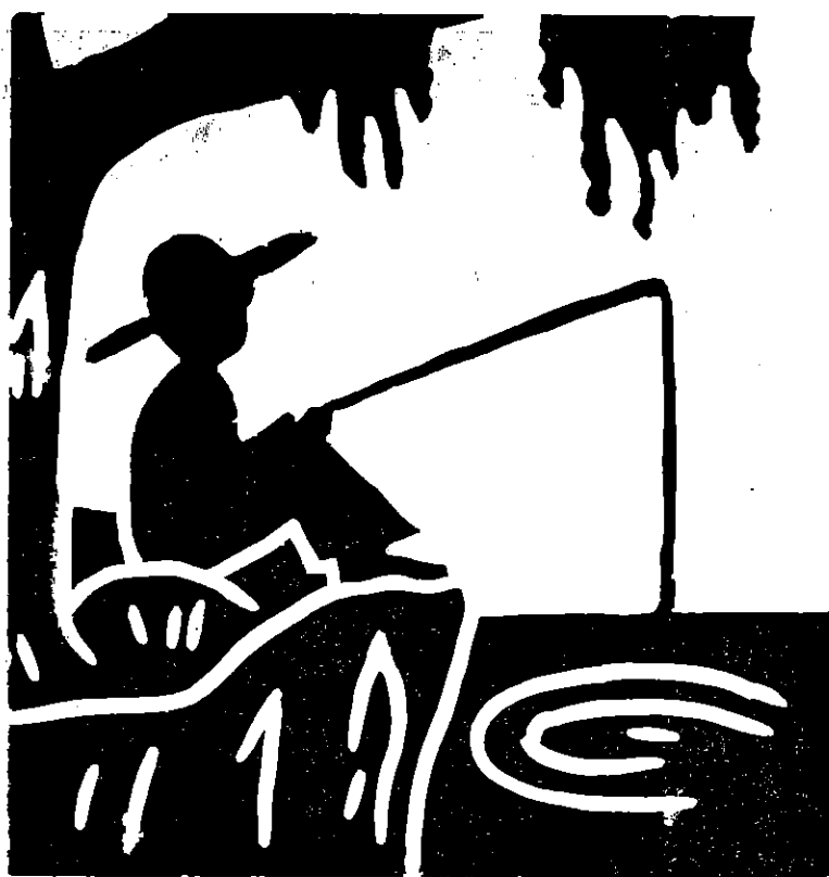
"VACATION FROM SCHOOL"

All in all our school could be greatly enlarged to take care of the overcrowded conditions which have taken place already in our school.