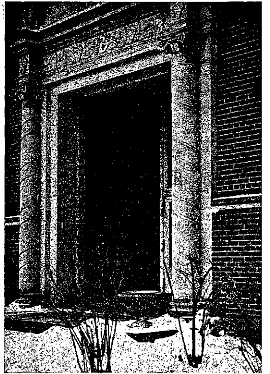
THE PORTALS OF OUR SCHOOL

They also took a hike with the Hi-Y on May 15.