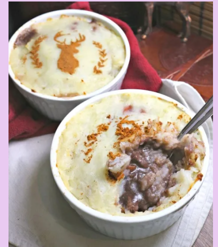
Dresden Files Wild Hunt Pie