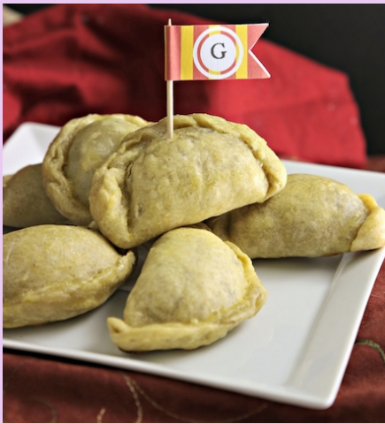
Godric Gryffindor Beef & Apple Pasties