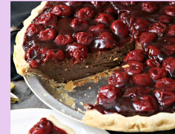
Star Trek: Voyager Fudge Ripple Pudding Cherry Pie