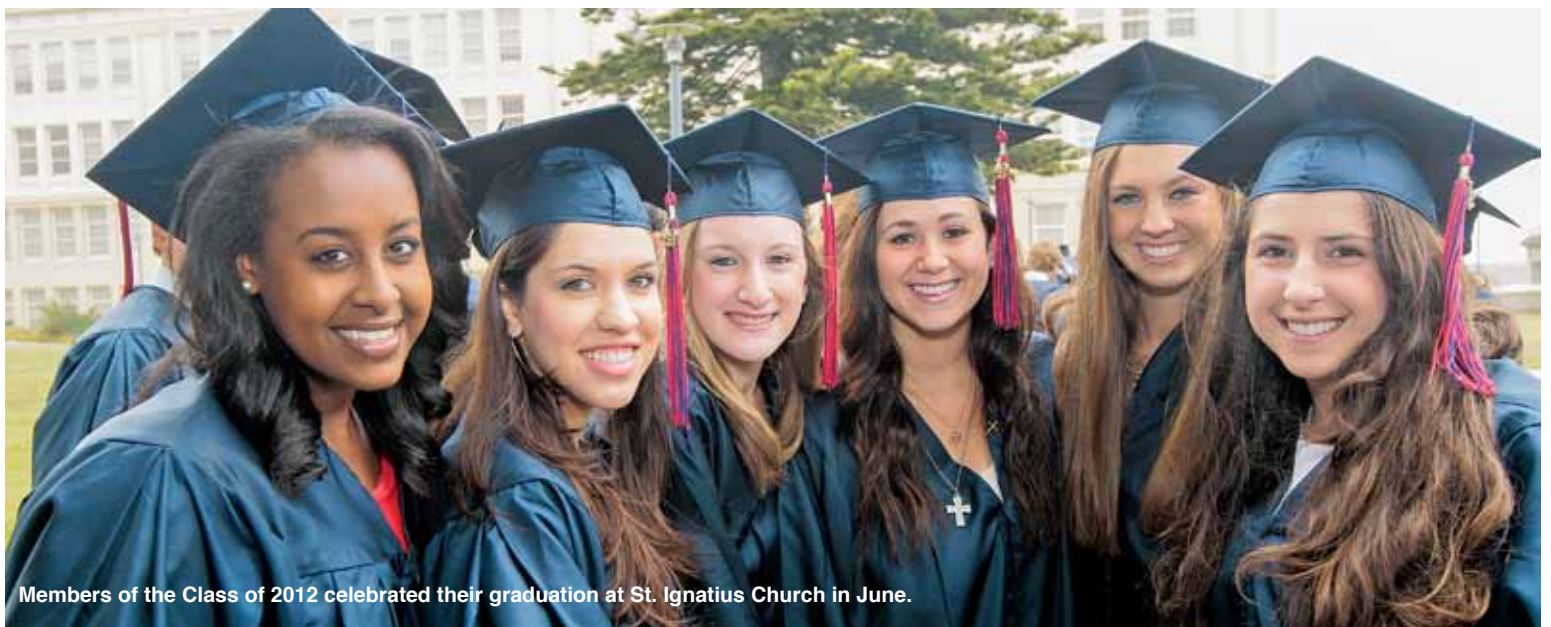
Members of the Class of 2012 celebrated their graduation at St. Ignatius Church in June.