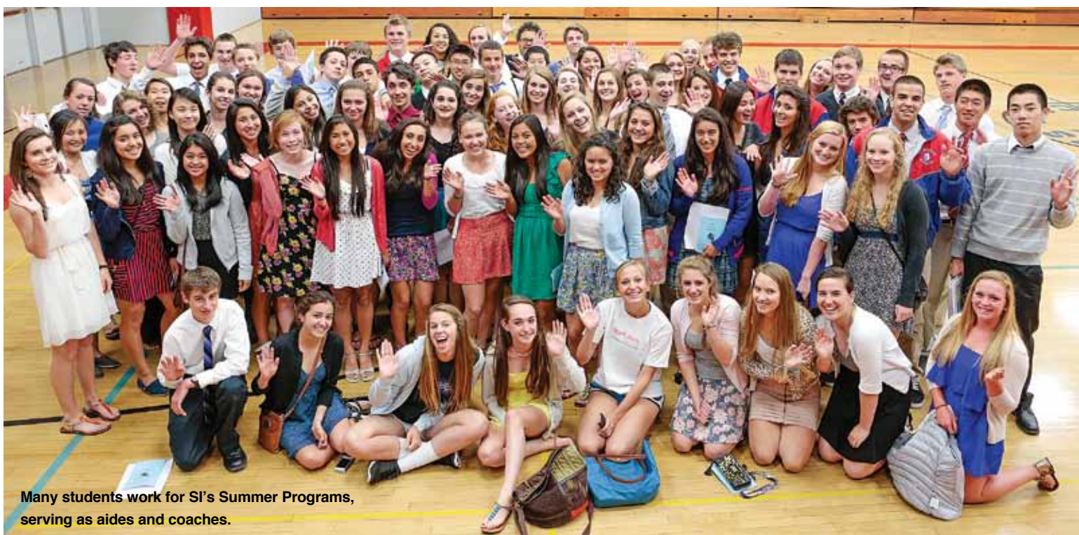
Many students work for SI's Summer Programs, serving as aides and coaches.