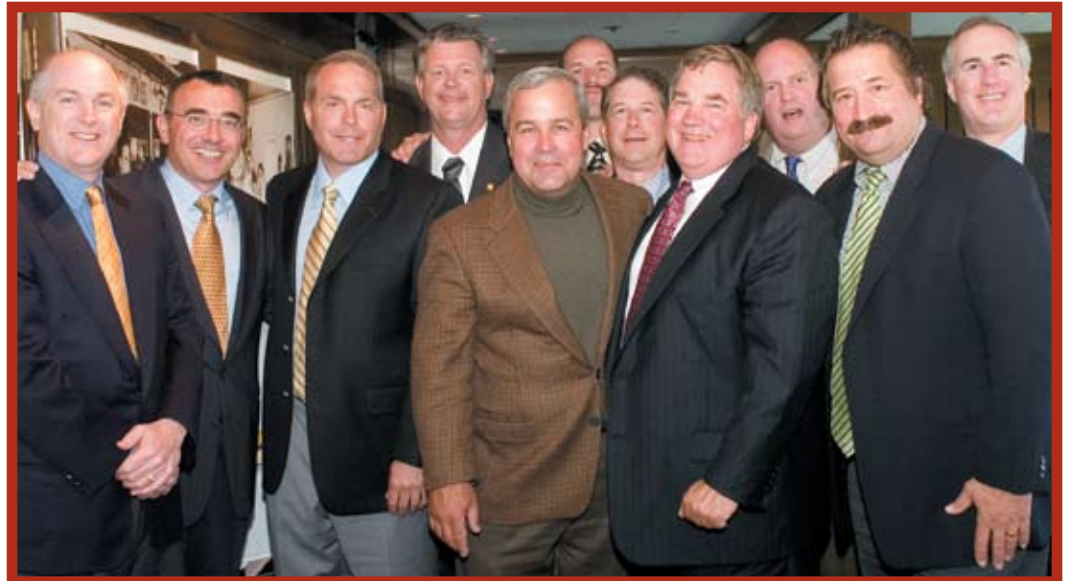
The Fathers' Club created the most successful auction ever with Sports Rally!