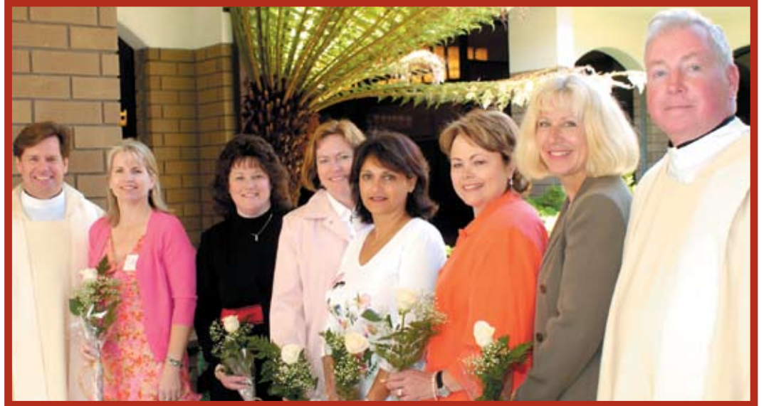
The Ignatian Guild once again sponsored the successful fashion show and hosted the Streets of San Francisco food tent for the Day on the Boulevard Celebration.