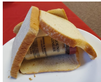
Literal—Ginger-Bread House Will—Teacher