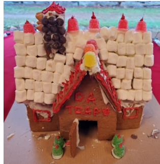
Da Trap Castle Ciara K.