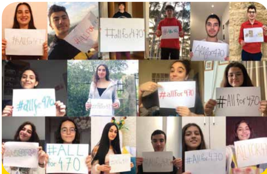
First members of the AGC (year 2019-2020)