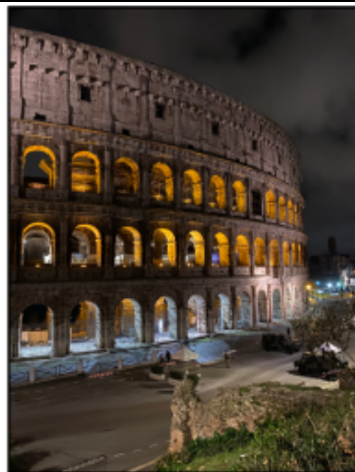
A Night in Rome

The entire Saint Joseph Community is proud of the efforts that the staff made under less than ideal circumstances last year. As they work to finalize this year's edition, the lessons learned from last year's success will no doubt help them achieve even greater heights.