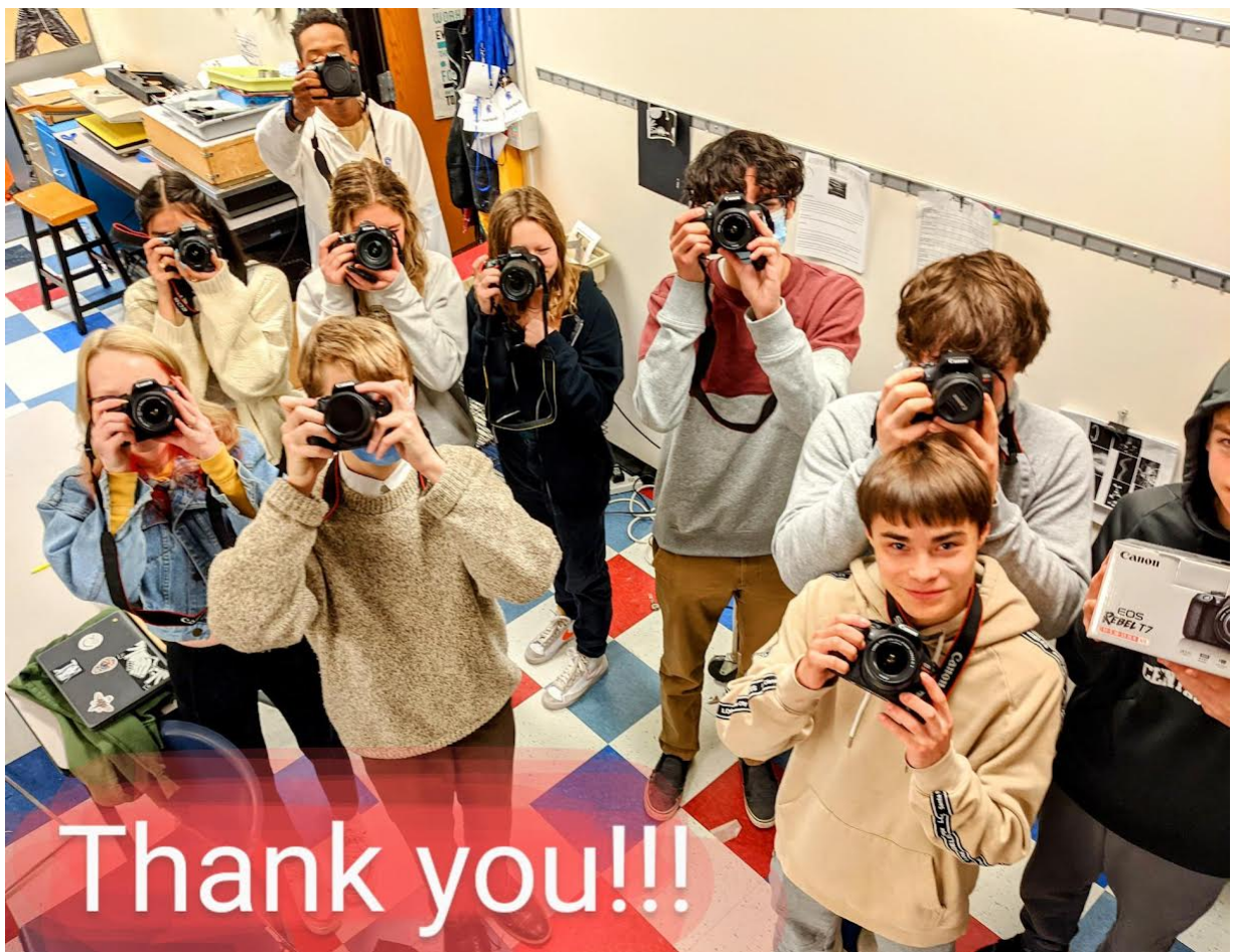
New cameras for photography class