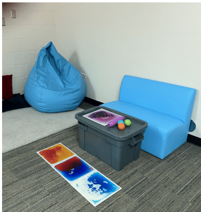
Sensory room supplies