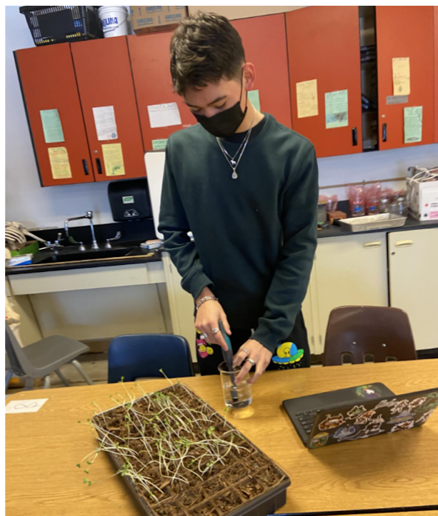
New equipment for IB Environmental Systems class