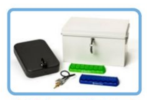
Plus! Get a free safety toolkit mailed to you!*