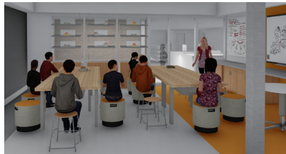
MS STEAM CENTER AND LIBRARY