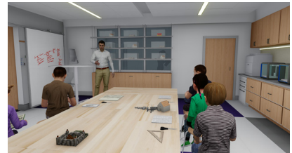
LS STEAM FACILITIES AND CLASSROOMS