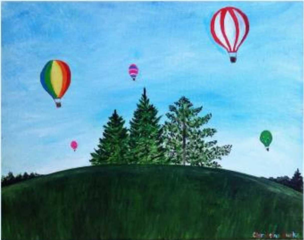
Let Your Dreams Take Flight - Kuerner Hill