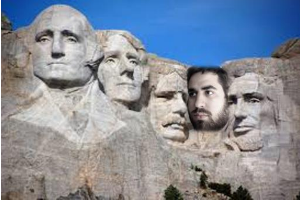
Mt. Rushmore: All of America's most important people