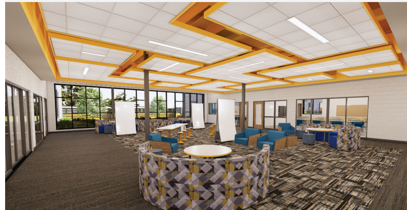
COLLABORATION AREA AT VEL PHILLIPS MIDDLE SCHOOL

Regarding the Secure Entry Projects at Read Elementary School, Oakwood Elementary School, North High School, and West High School, these projects went out to bid in mid-December to four different pre-selected General Contractors. Contractors will begin to review the drawings and there is a pre-bid meeting and walkthroughs of the existing buildings in early January.