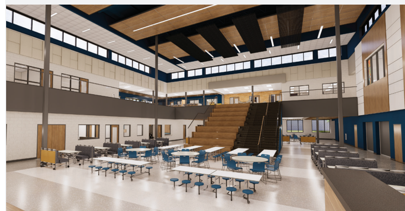
THE COMMONS AT VEL PHILLIPS MIDDLE SCHOOL