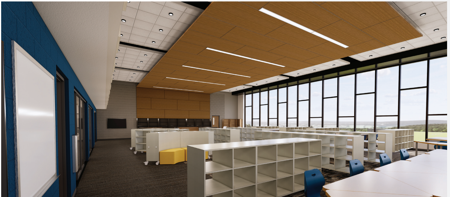
THE JESSIE JACK HOOPER MEDIA CENTER AT VEL PHILLIPS MIDDLE SCHOOL