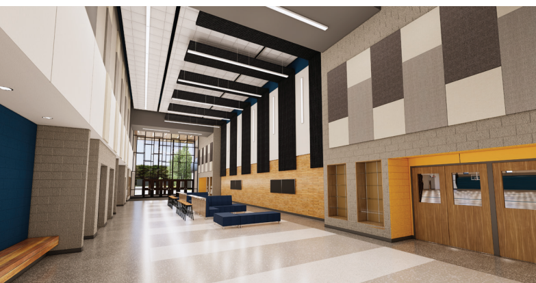
EVENTS LOBBY AT VEL PHILLIPS MIDDLE SCHOOL