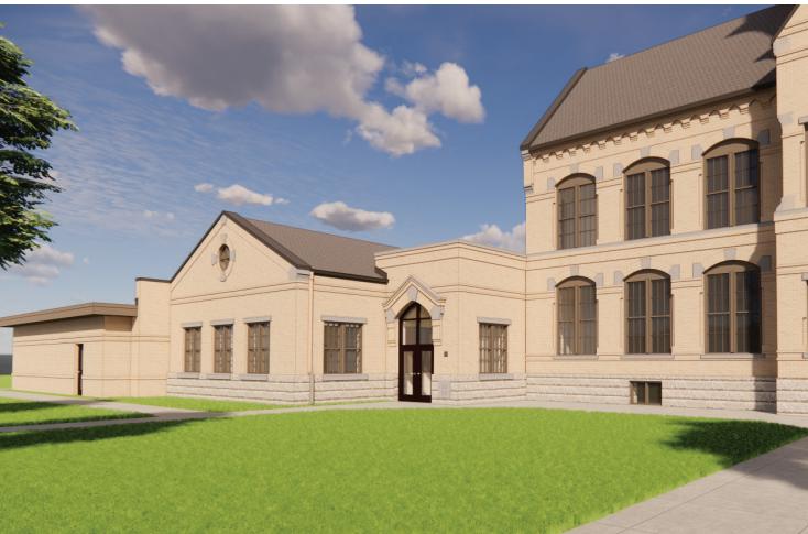
READ ELEMENTARY SCHOOL MAIN ENTRANCE ADDITION