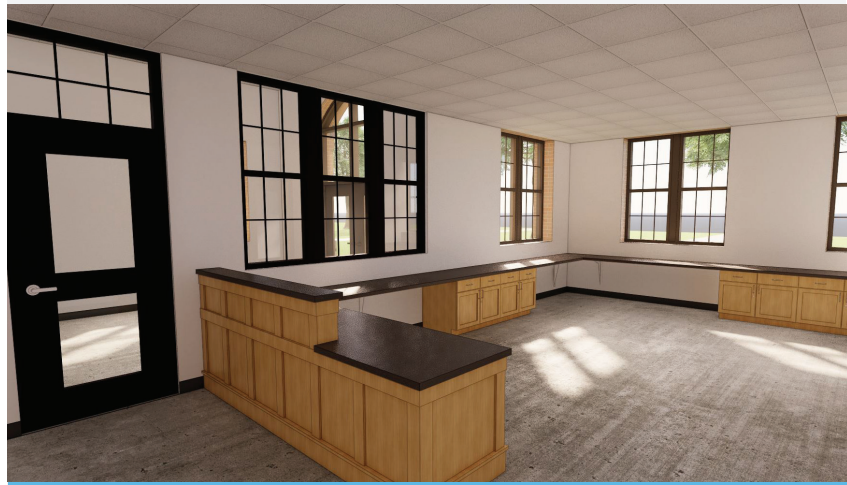
READ ELEMENTARY SCHOOL MAIN OFFICE ADDITION