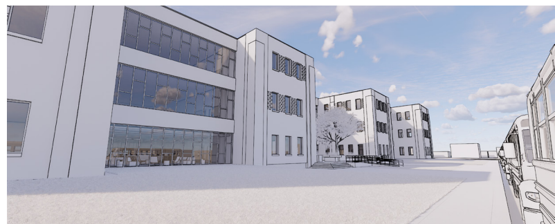
CLASSROOM ELEVATION CONCEPTUAL RENDERING