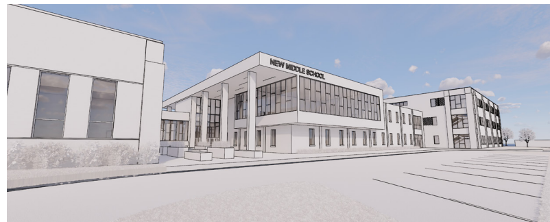
MAIN ENTRY CONCEPTUAL RENDERING