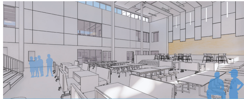
PRELIMINARY COMMONS/CAFETERIA RENDERING