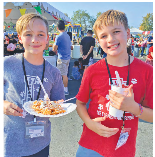
Lee School Carnival!