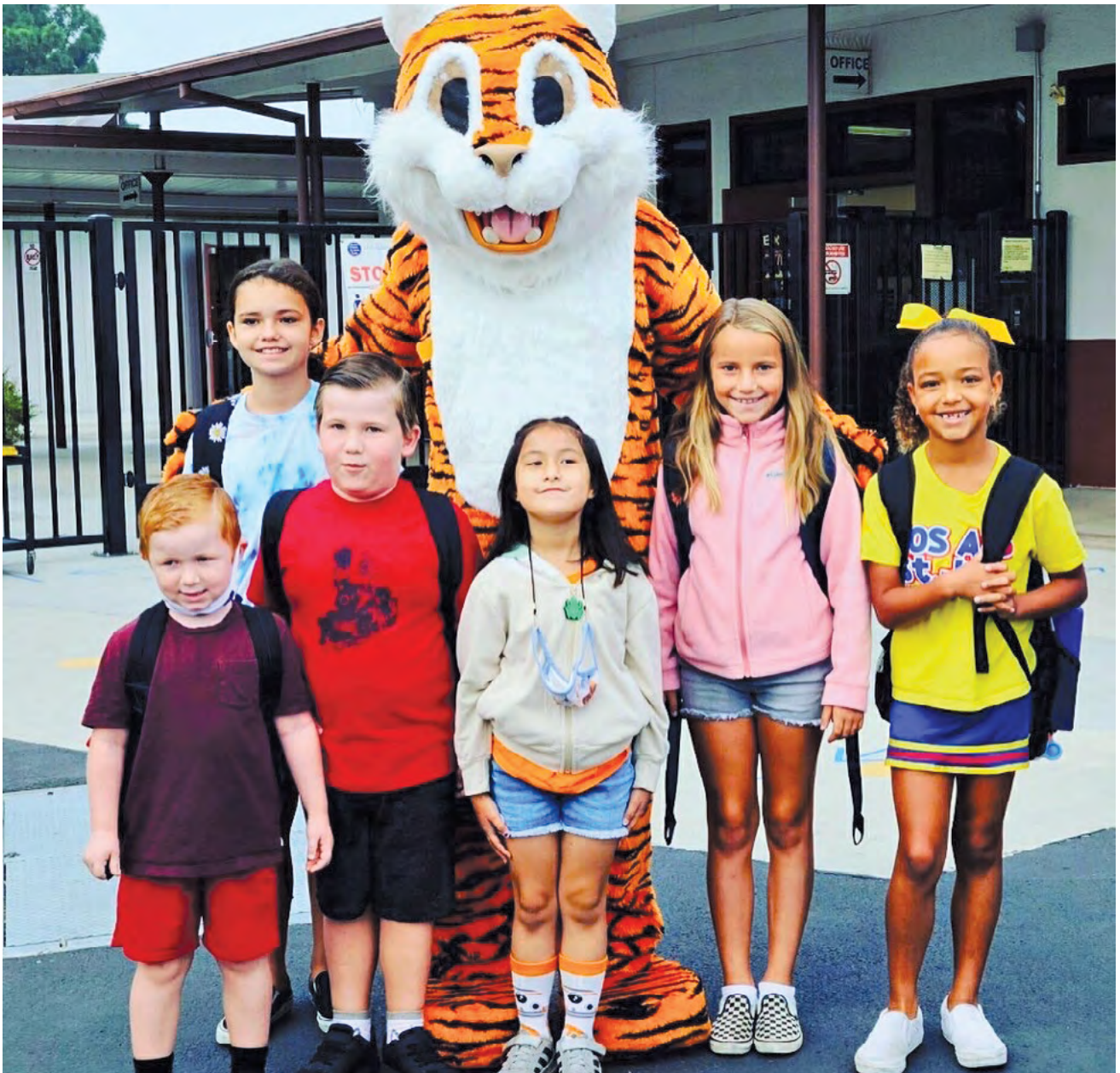
Stripes helps LAE celebrate winning the National Blue Ribbon