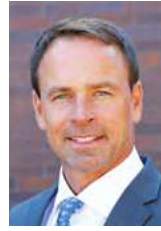
Terry L. Walker Superintendent

The critical role of schools, as the heart of our communities, has never been more apparent. Working in partnership with our teachers, staff, students and families, IUSD was one of the first school districts in California to reopen for in-person instruction in September 2020 and to remain open. To meet our community's diverse needs and with stakeholder input, we offered a traditional K-6 academic model, along with TK-12 hybrid and online options, while preventing or limiting the spread of COVID-19 on our campuses.