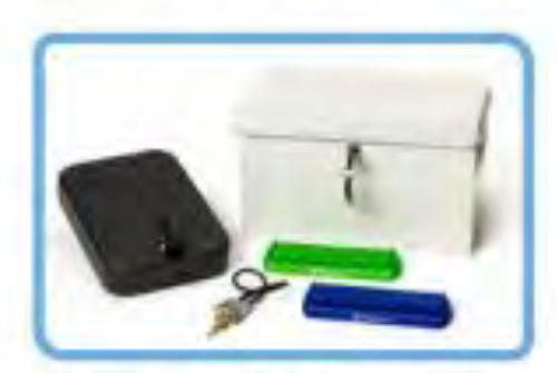
Plusi Get a free safety toolkit moiled to you!+