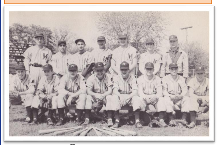
1952 1ST SECTION V CHAMPION