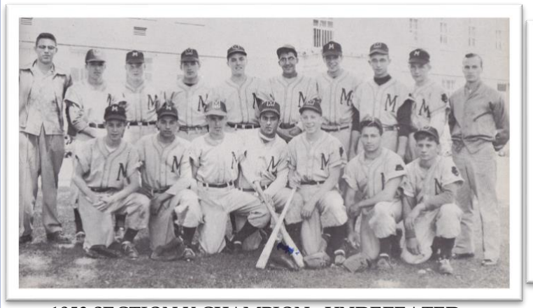
1953 SECTION V CHAMPION - UNDEFEATED