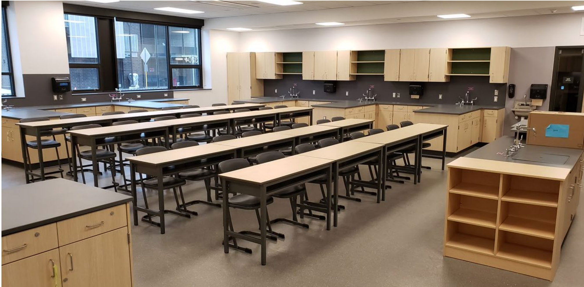
Science and all other classrooms complete