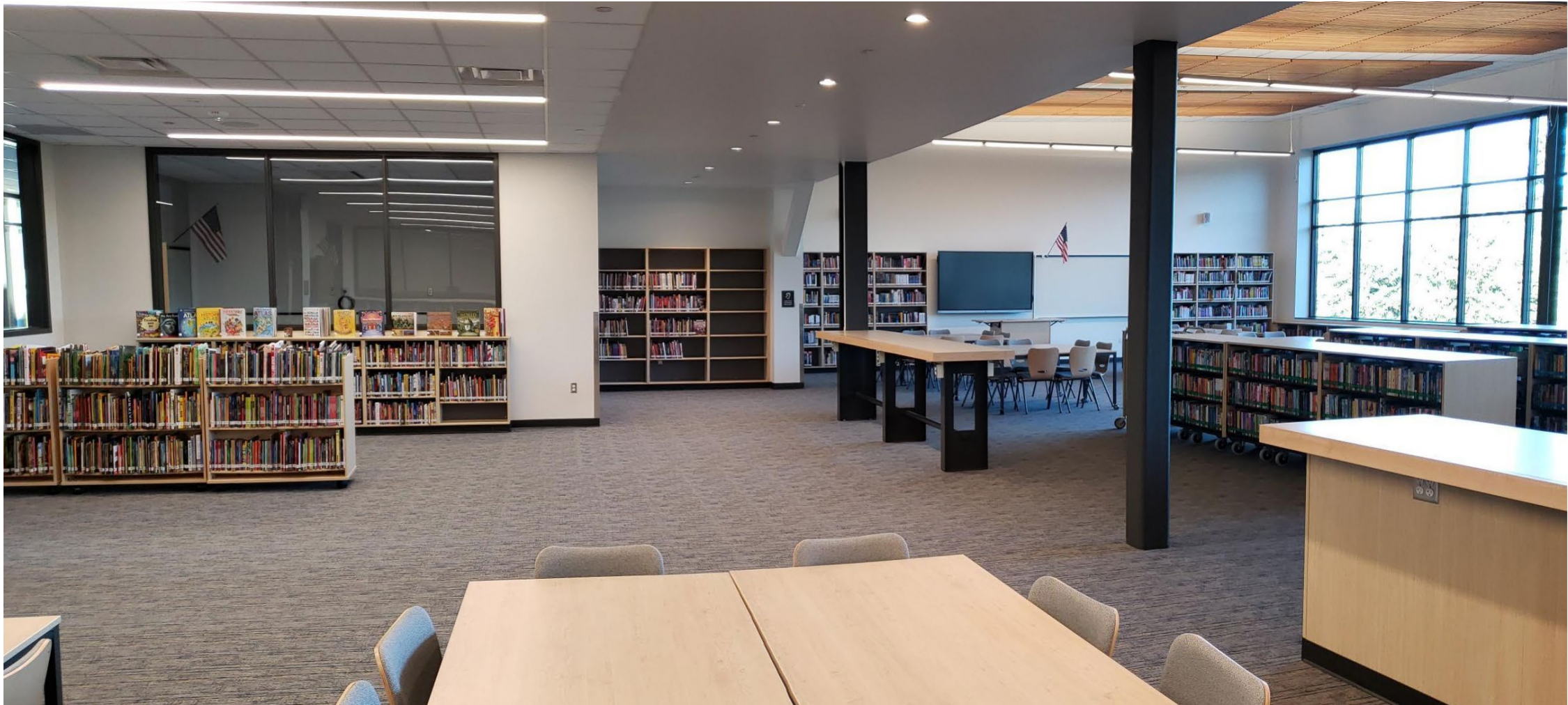
The Library is complete and stocked with books