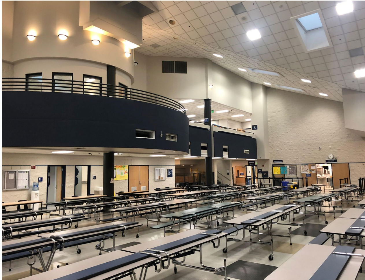
Remodeled Commons nearing completion