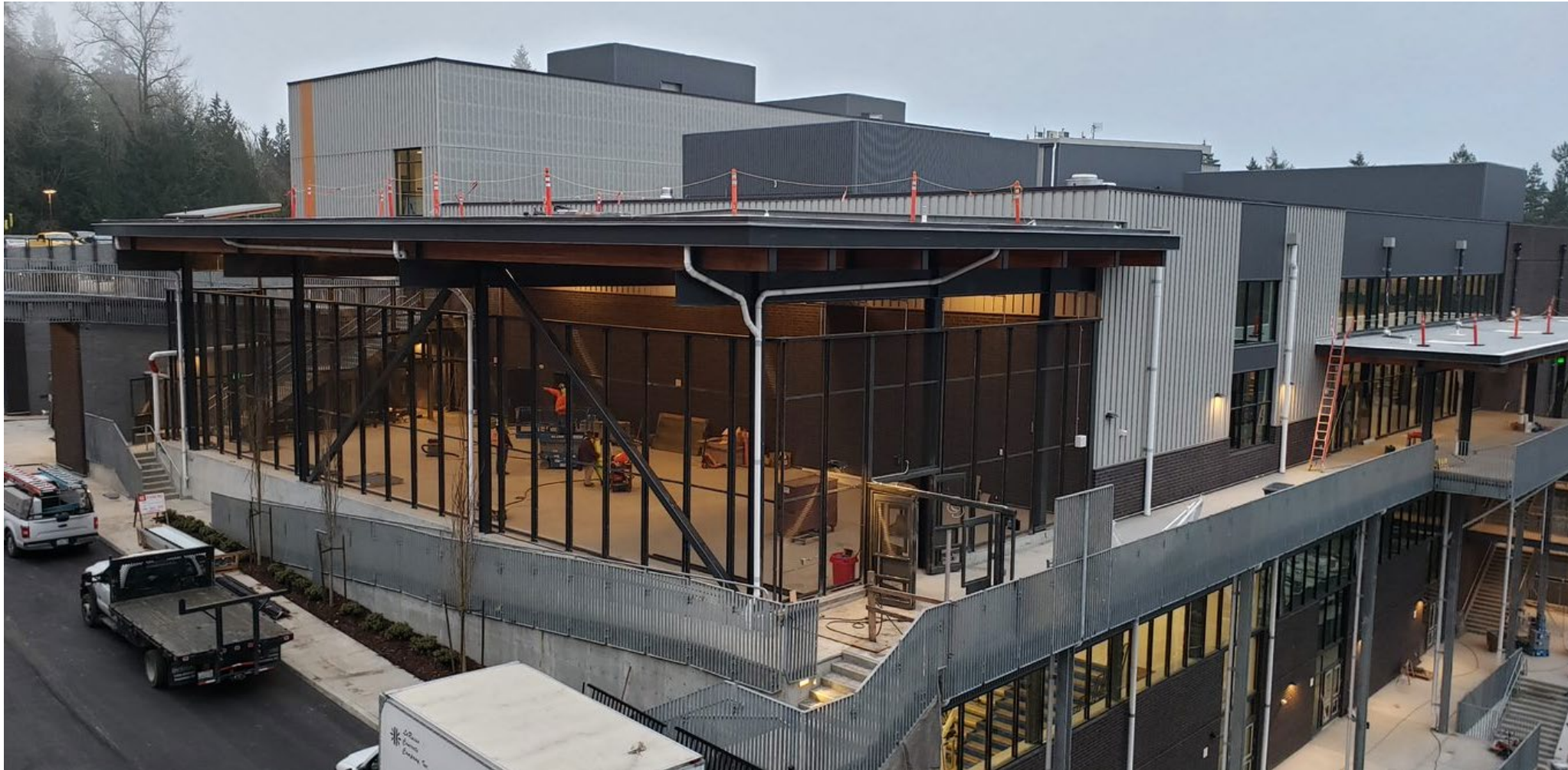
View of the Covered Play Area from the Bus Loop