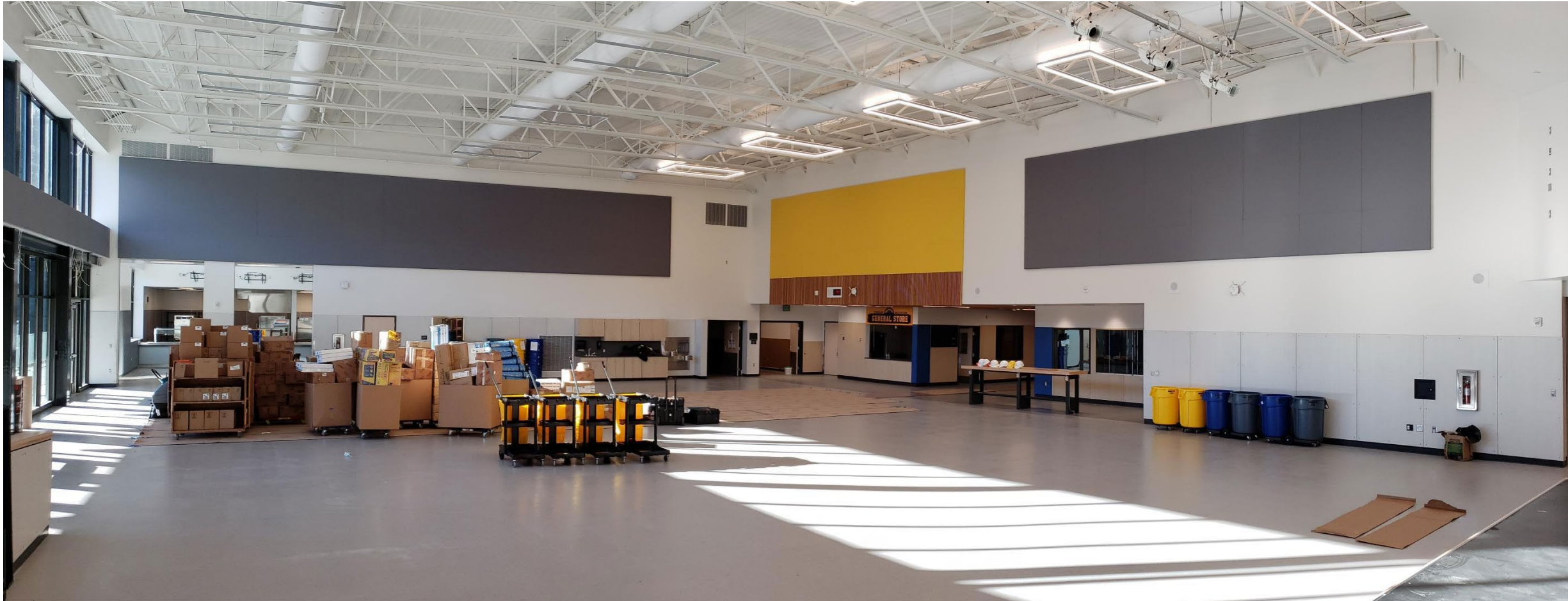
The Commons nearing completion