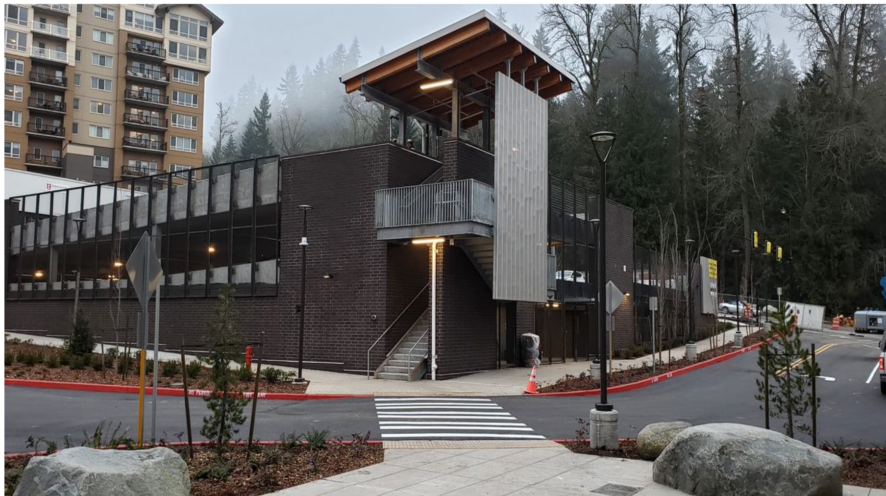
View of the Parking Garage from the Main Entry