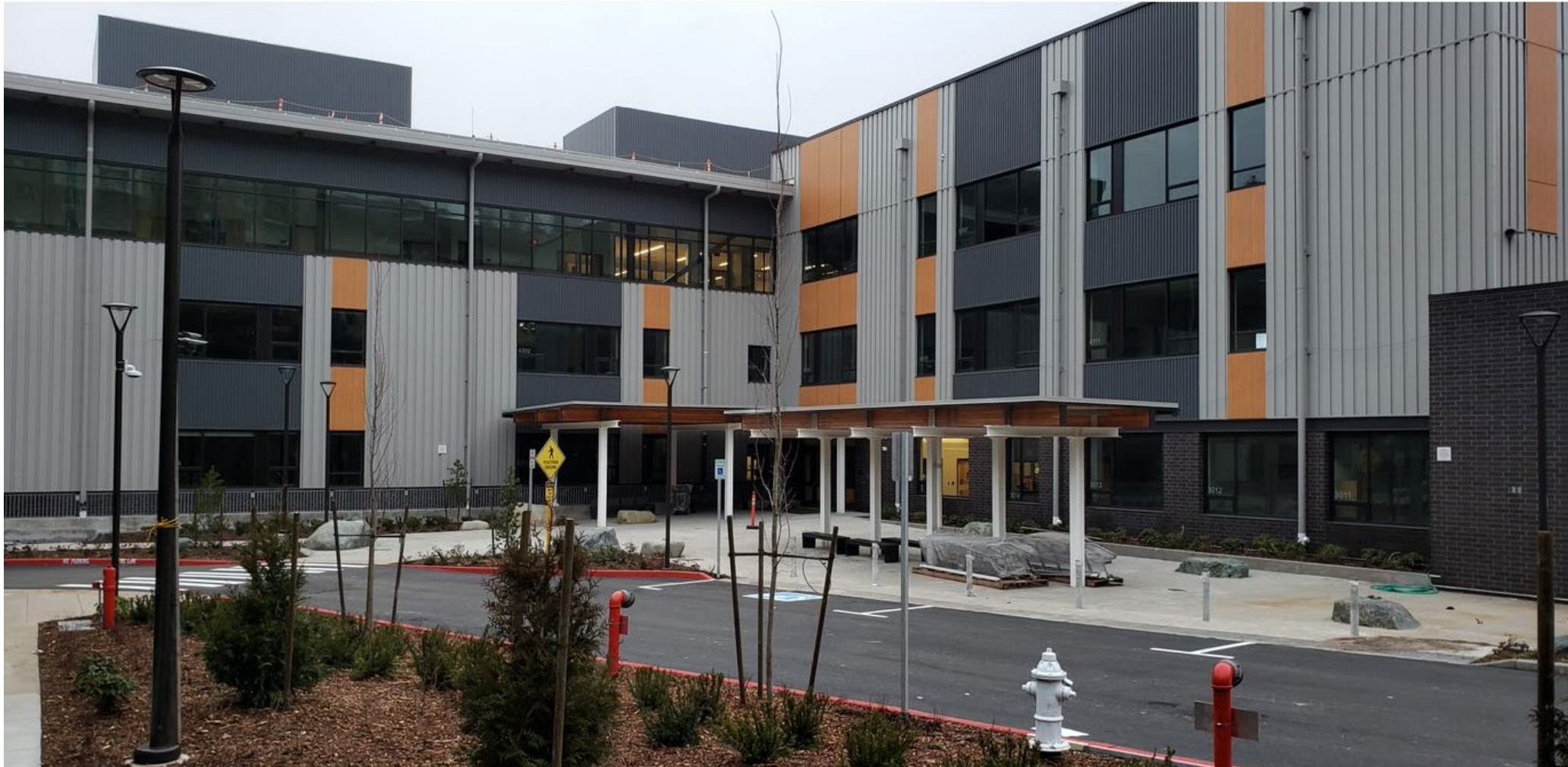
View of the Main Entry (3 rd Floor)