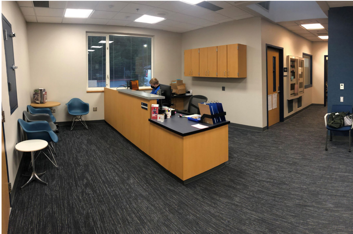
Newly remodeled Main Office Area complete and in use