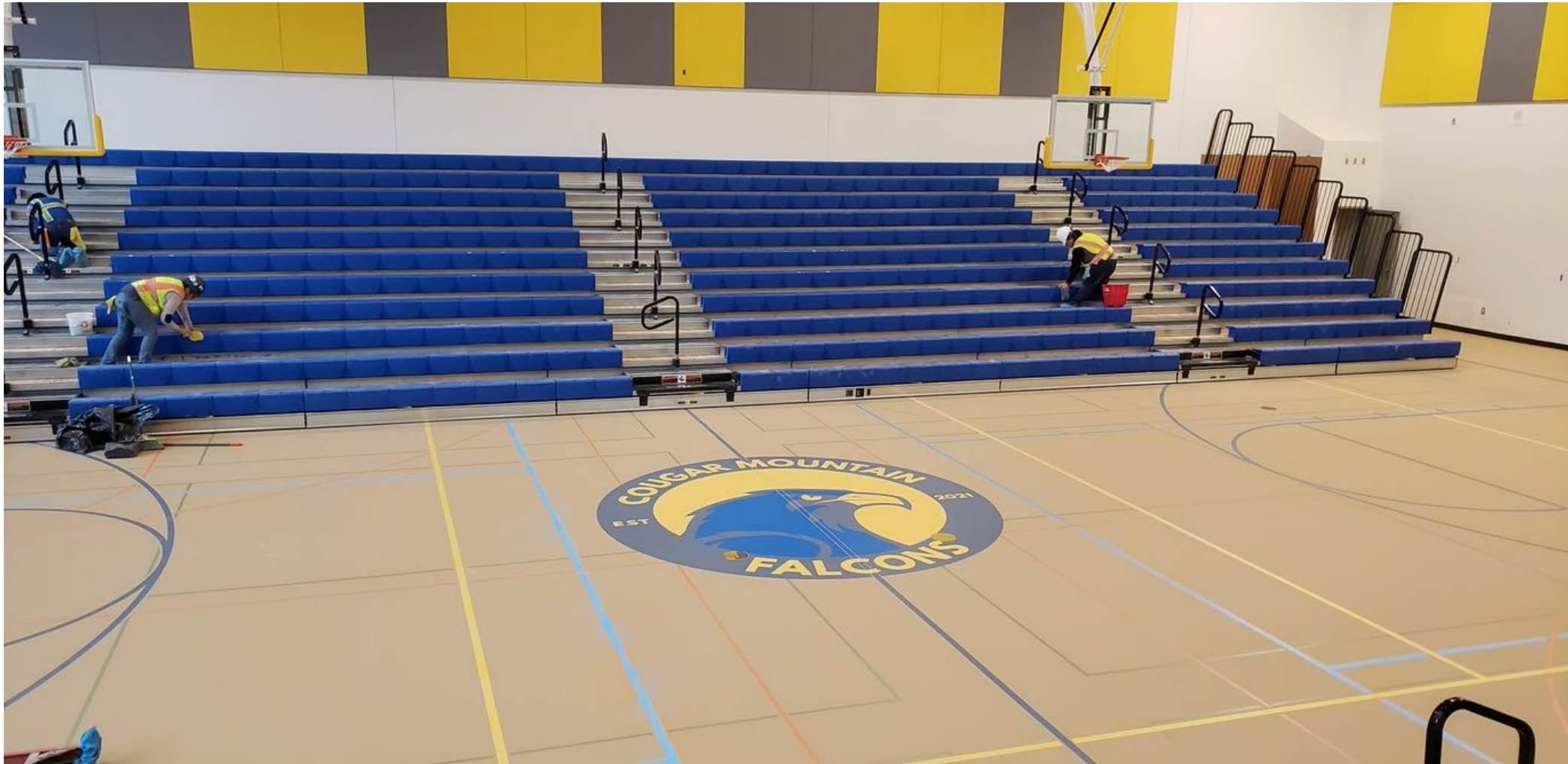
Finishing touches being done in the Main Gym