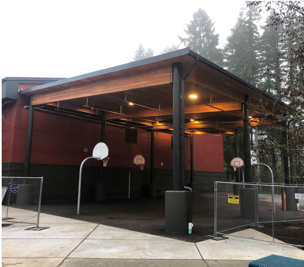
New Covered Play Area complete and in use