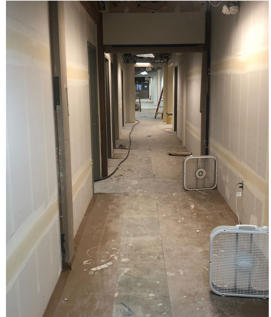
Corridor getting ready for finishes