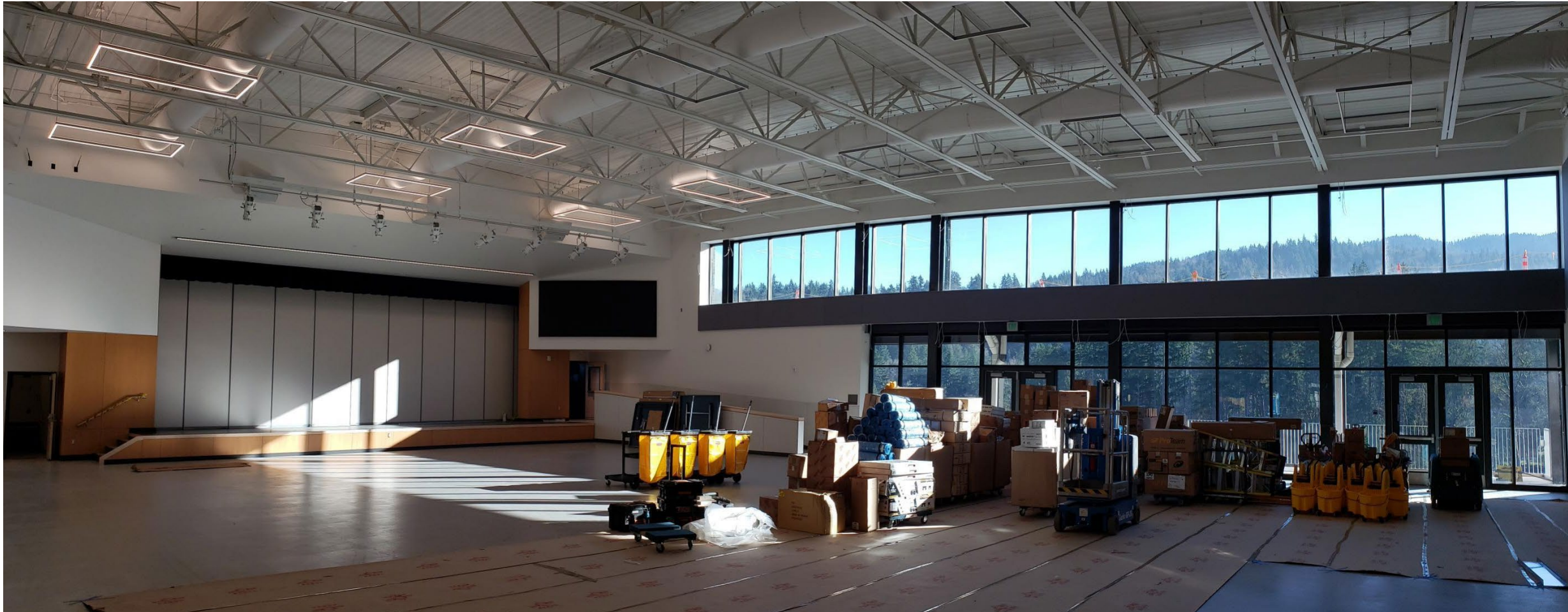
View of the Commons and Stage nearing completion