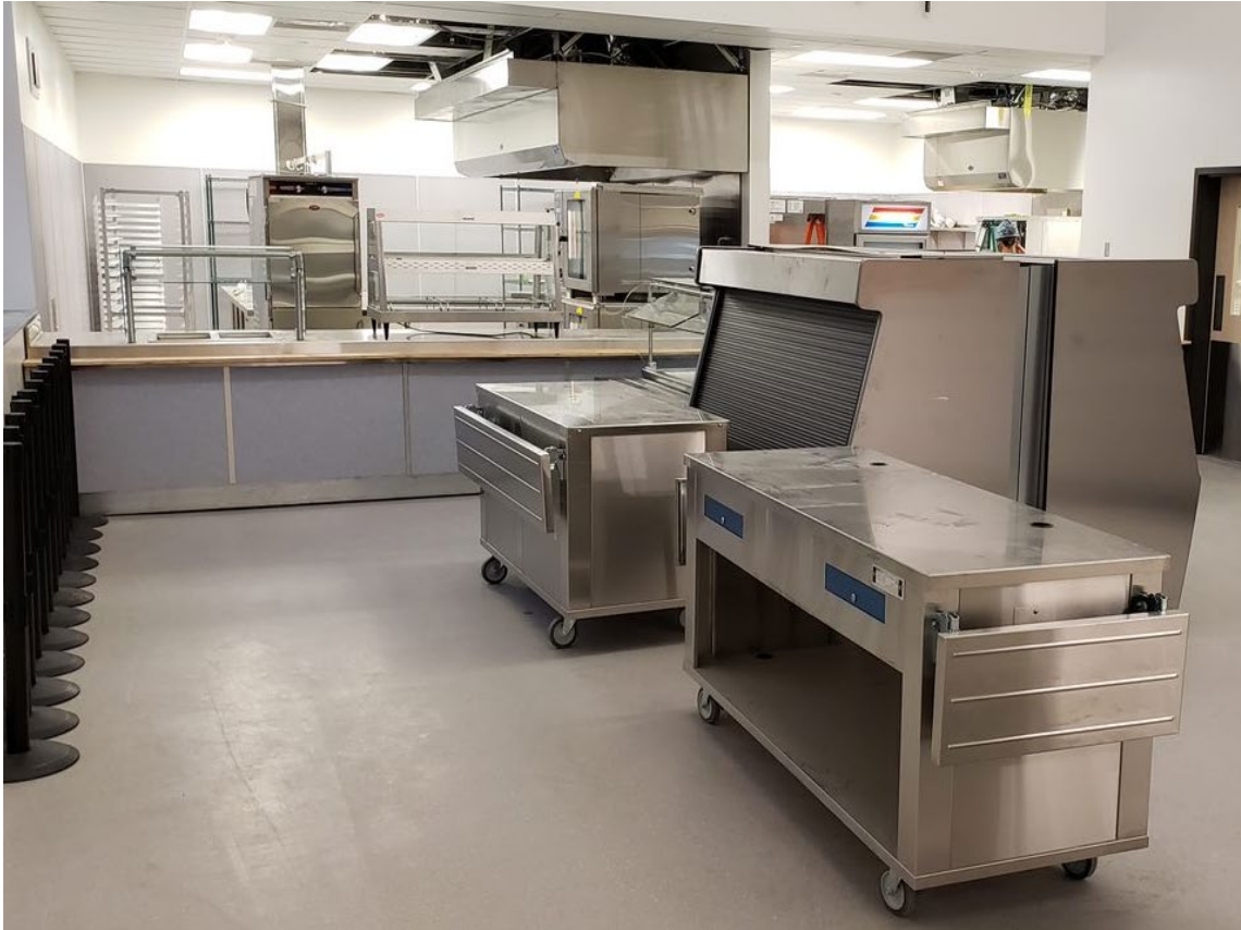
The Servery ready for use