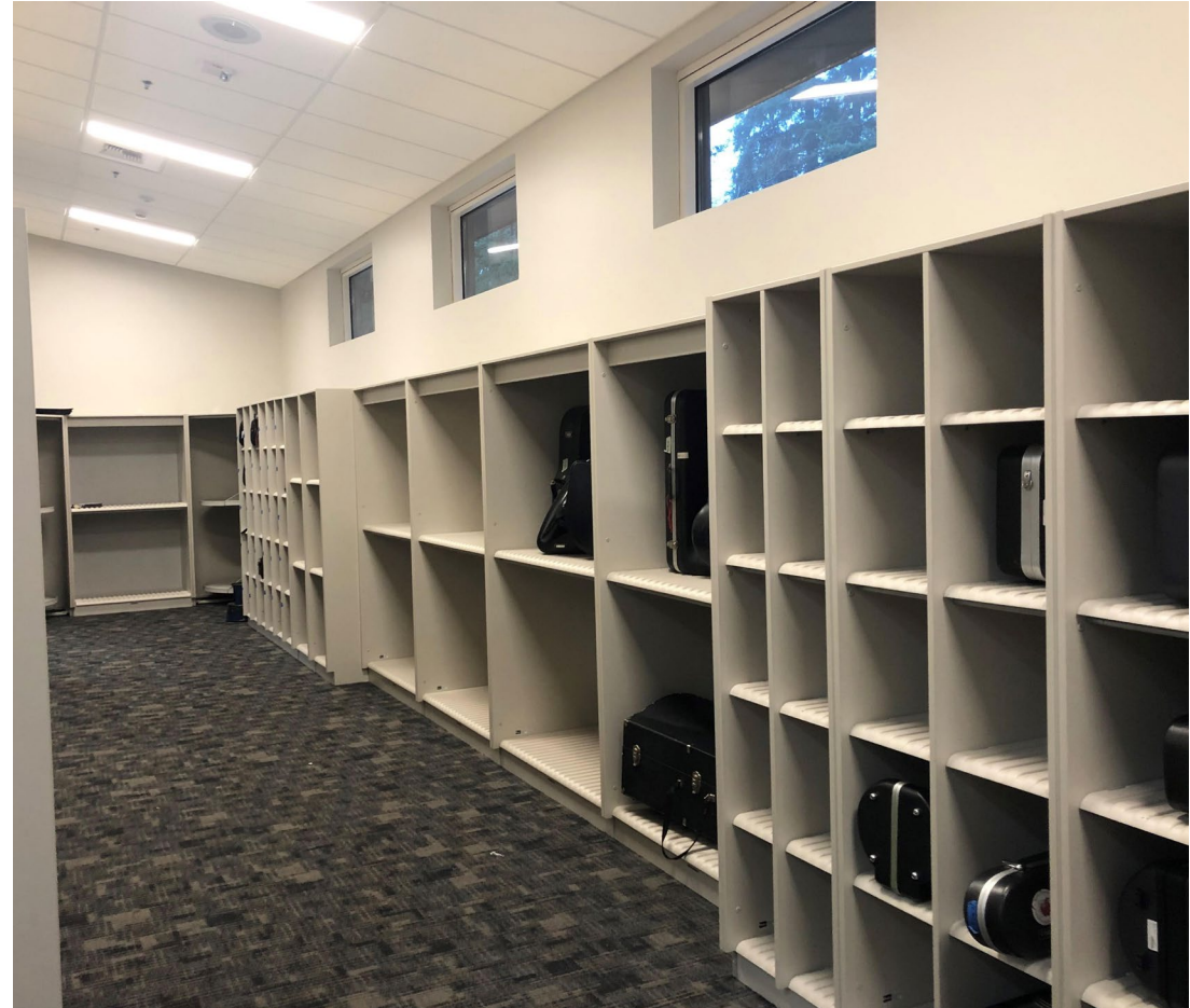
New Music Storage Room complete and in use