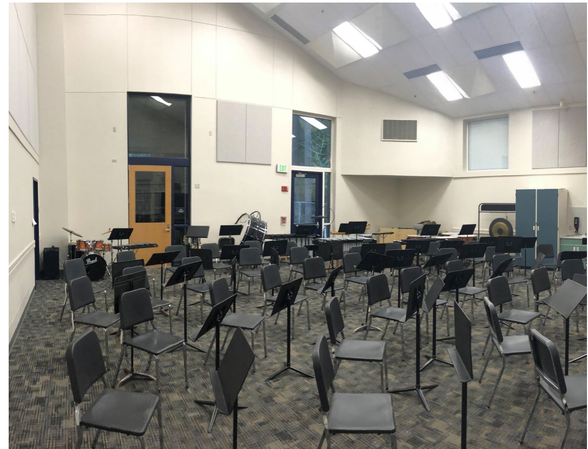
Remodeled Band Room completed and in use