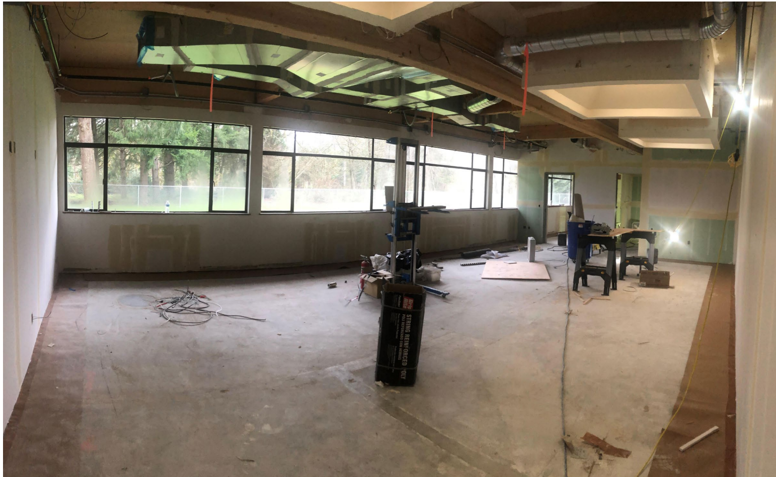
Classroom configuration coming together