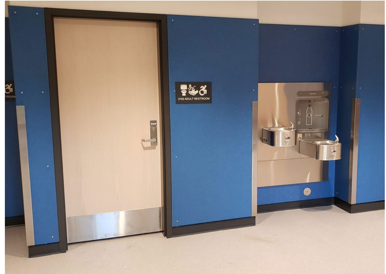
Each floor is color coded for more ease in wayfinding