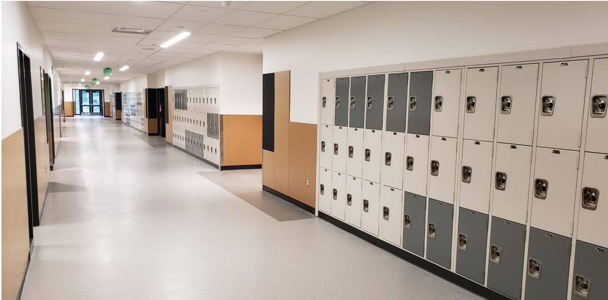
Corridors complete with lockers