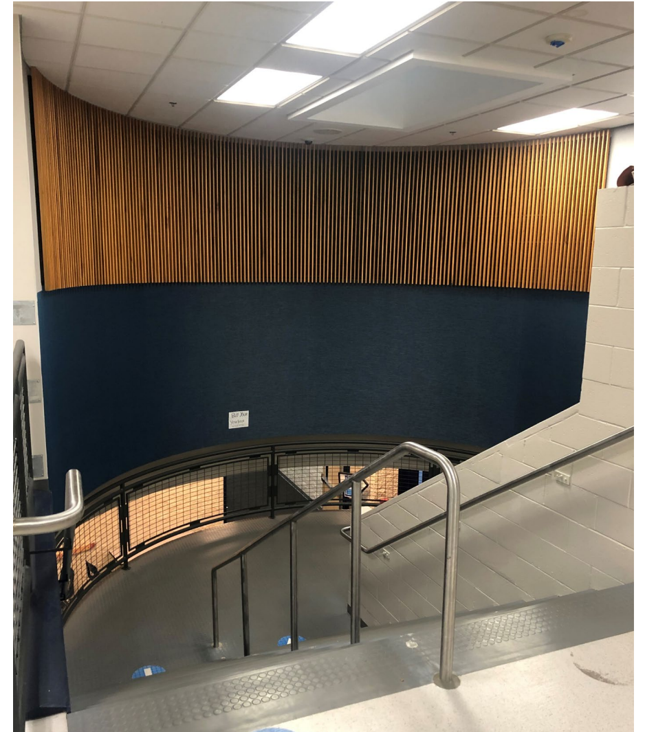
Remodeled stair areas with new wood trim