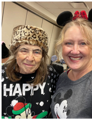
More photos on back cover