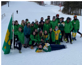
The Notre Dame Girls JV Ski team took first place at the annual Don Thomas Cup while the Boys took sixth